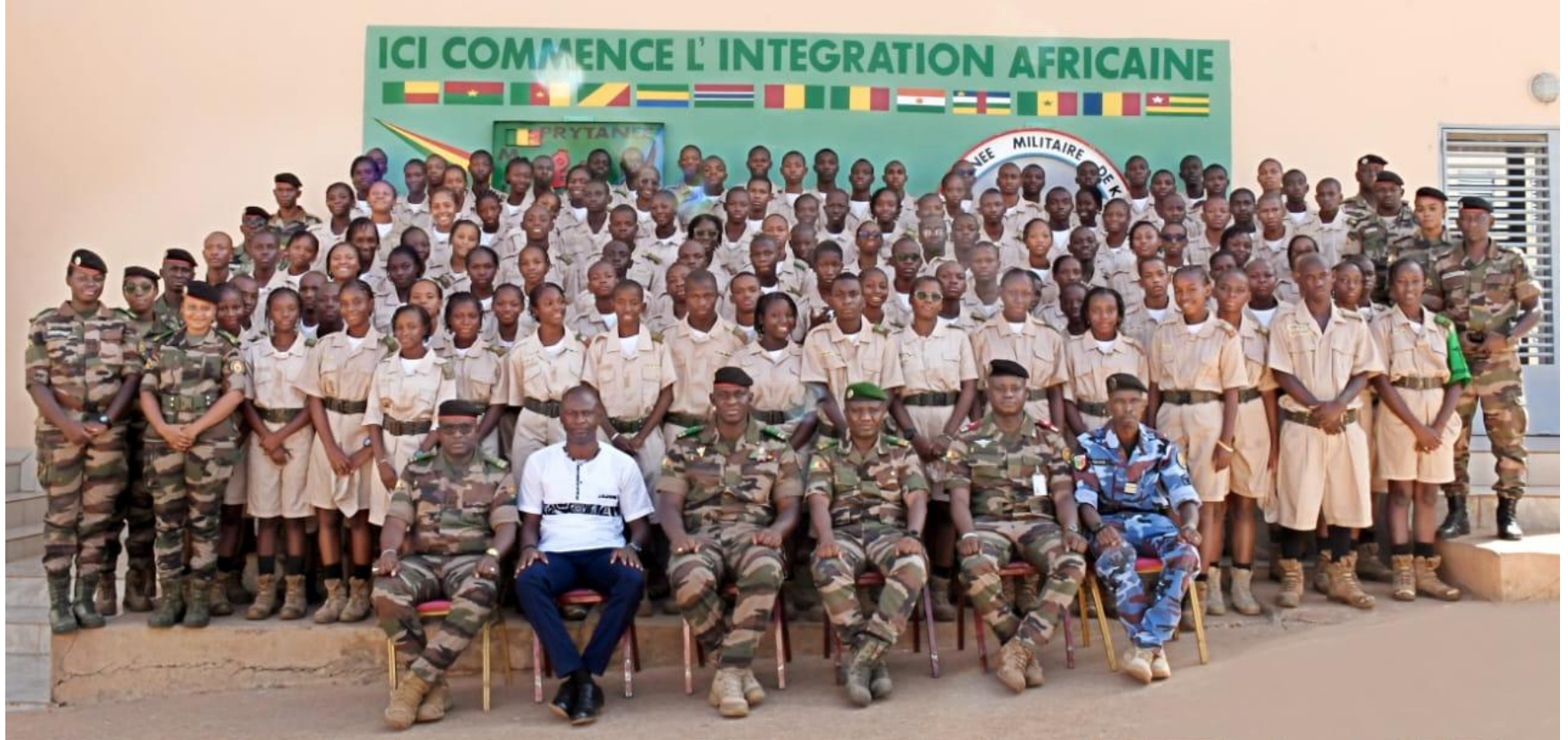
International Humanitarian Law (IHL 1-26 MALI) Prytanée Militaire (Kati, Mali) From 22 to 26 June 2026