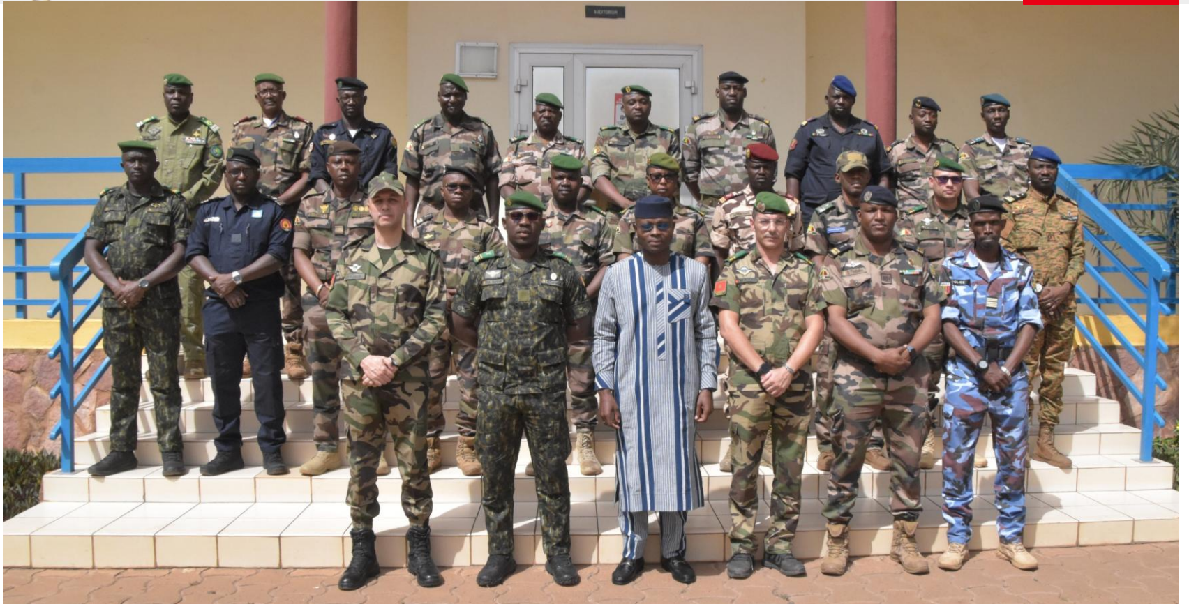
United Nations Staff Officers' Course (UNSOC 1-26 Morocco) EMP-ABB Trom 13th au 30th april 2026