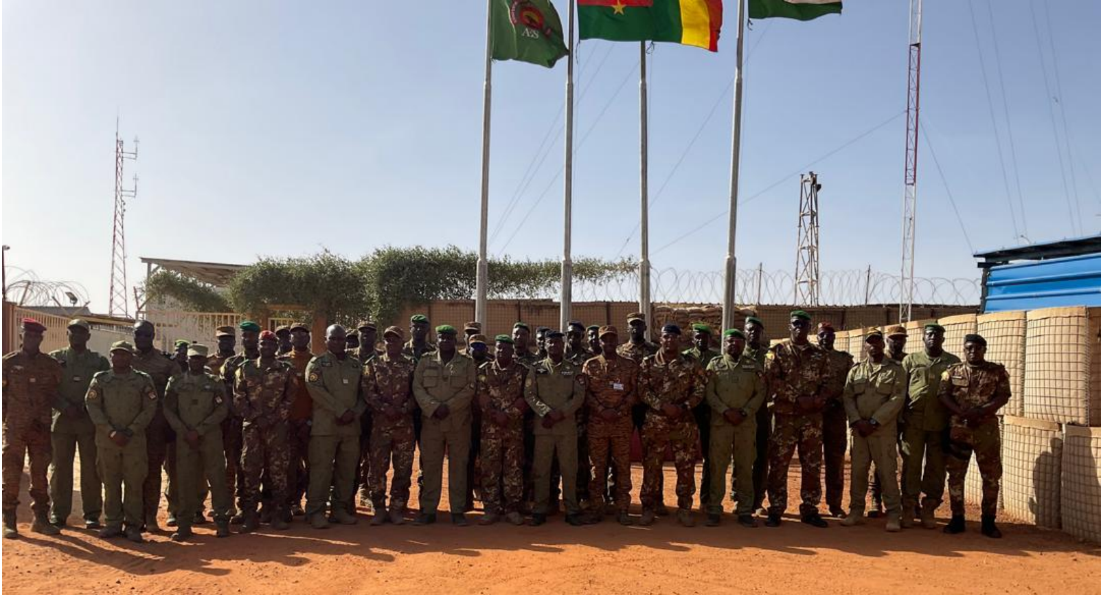
Command Post of the Unified Force of the Confederation of Sahel States (CP-UF AES) Niamey (Niger) From 08 to 19 December 2025