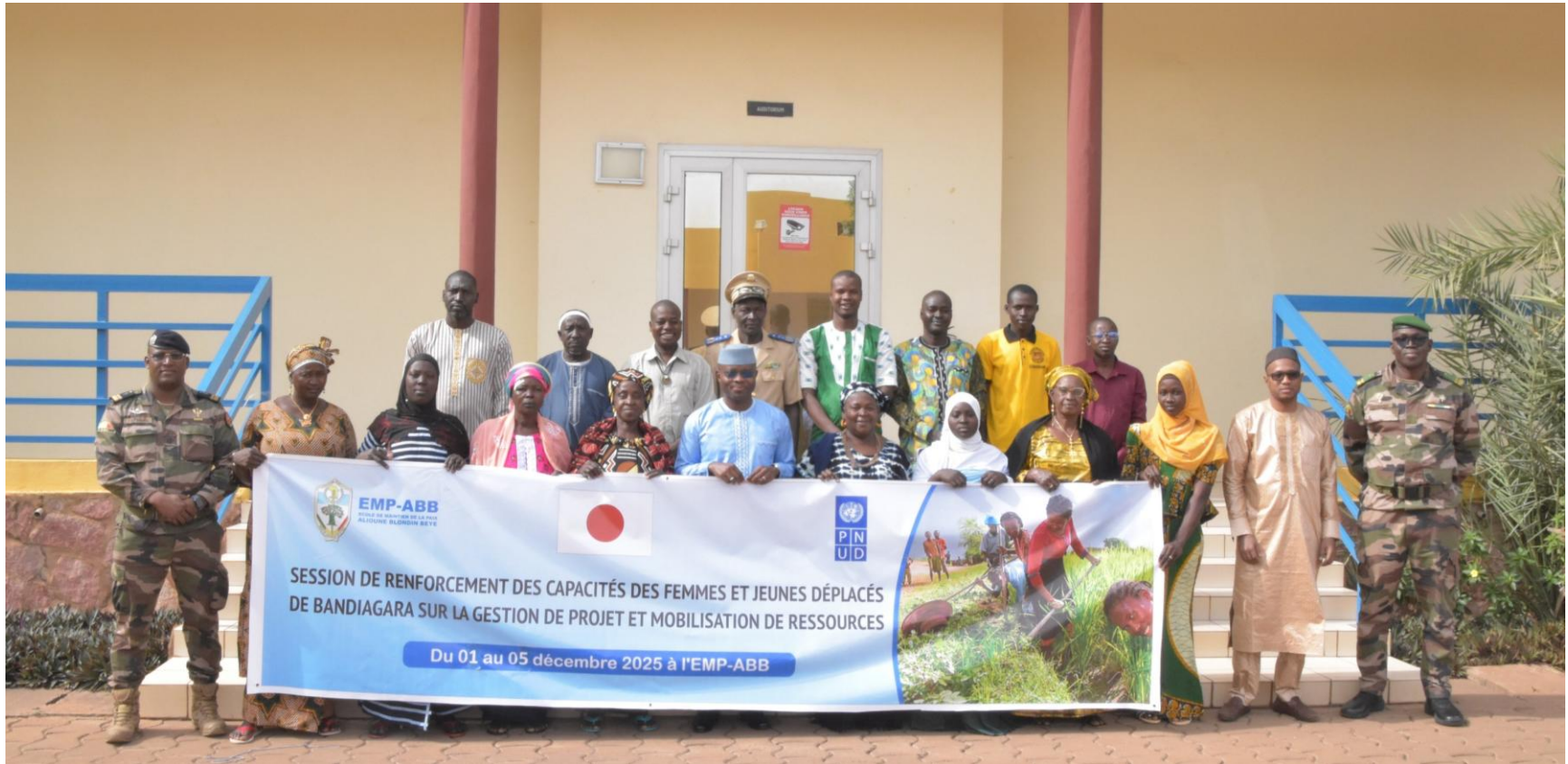
Project Management and Resource Mobilisation (PMRM) EMP-ABB (Bamako, Mali) From 01 to 05 December 2025