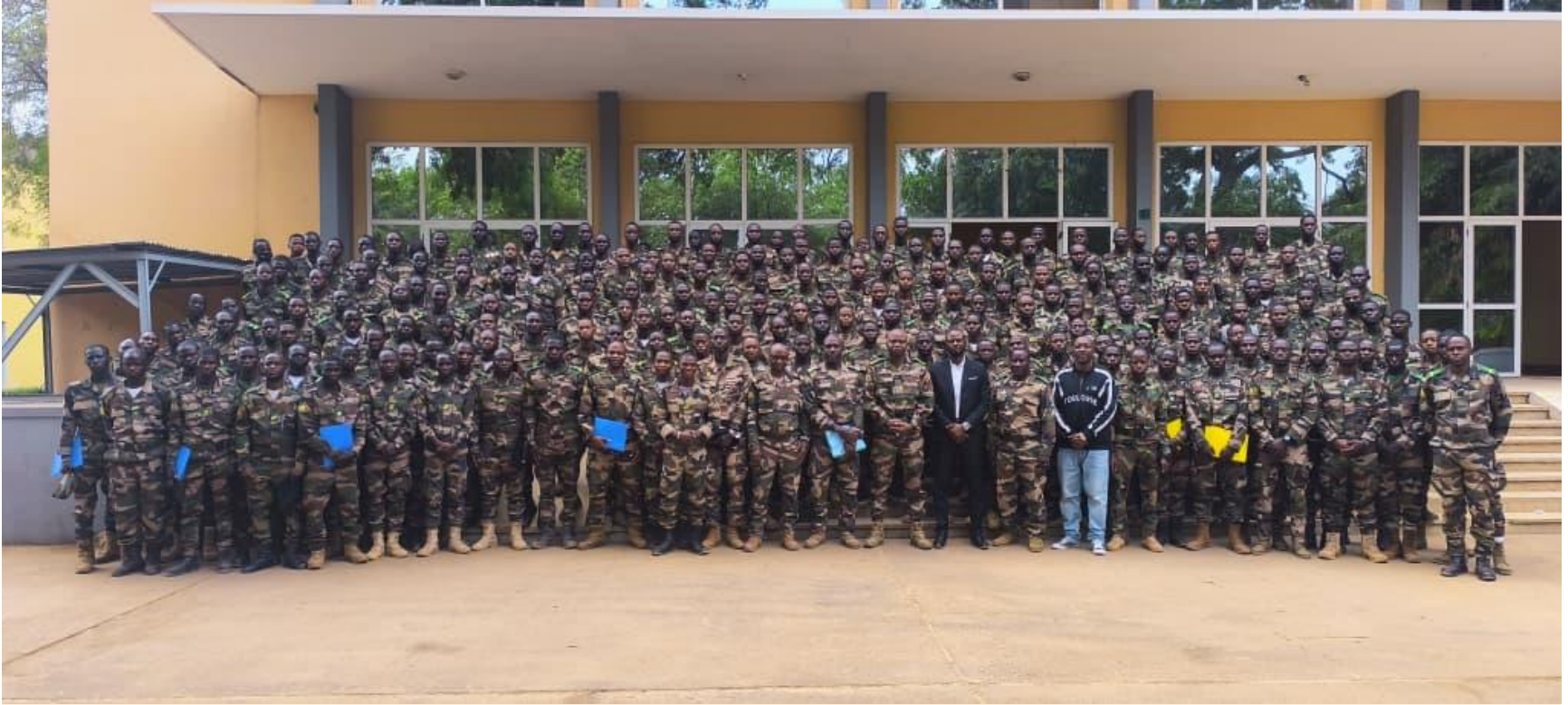
Protection of Civilians (PoC) / Human Rights (HR) / International Humanitarian Law (IHL) Koulikoro (Mali) From 01 to 05 December 2025