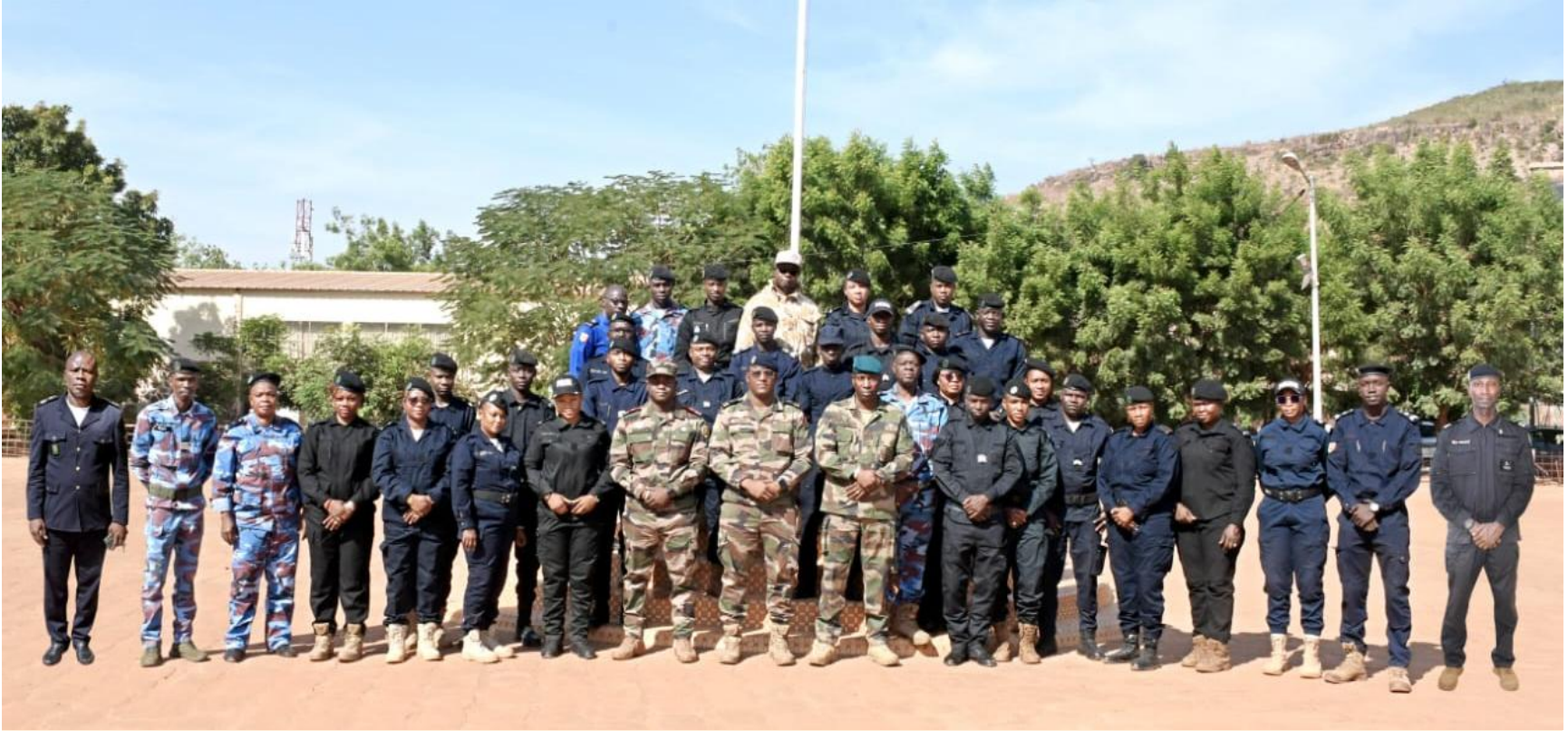
United Nations Police (UNPOL 4-25) NPA (Bamako, Mali) From 24 November to 05 December 2025