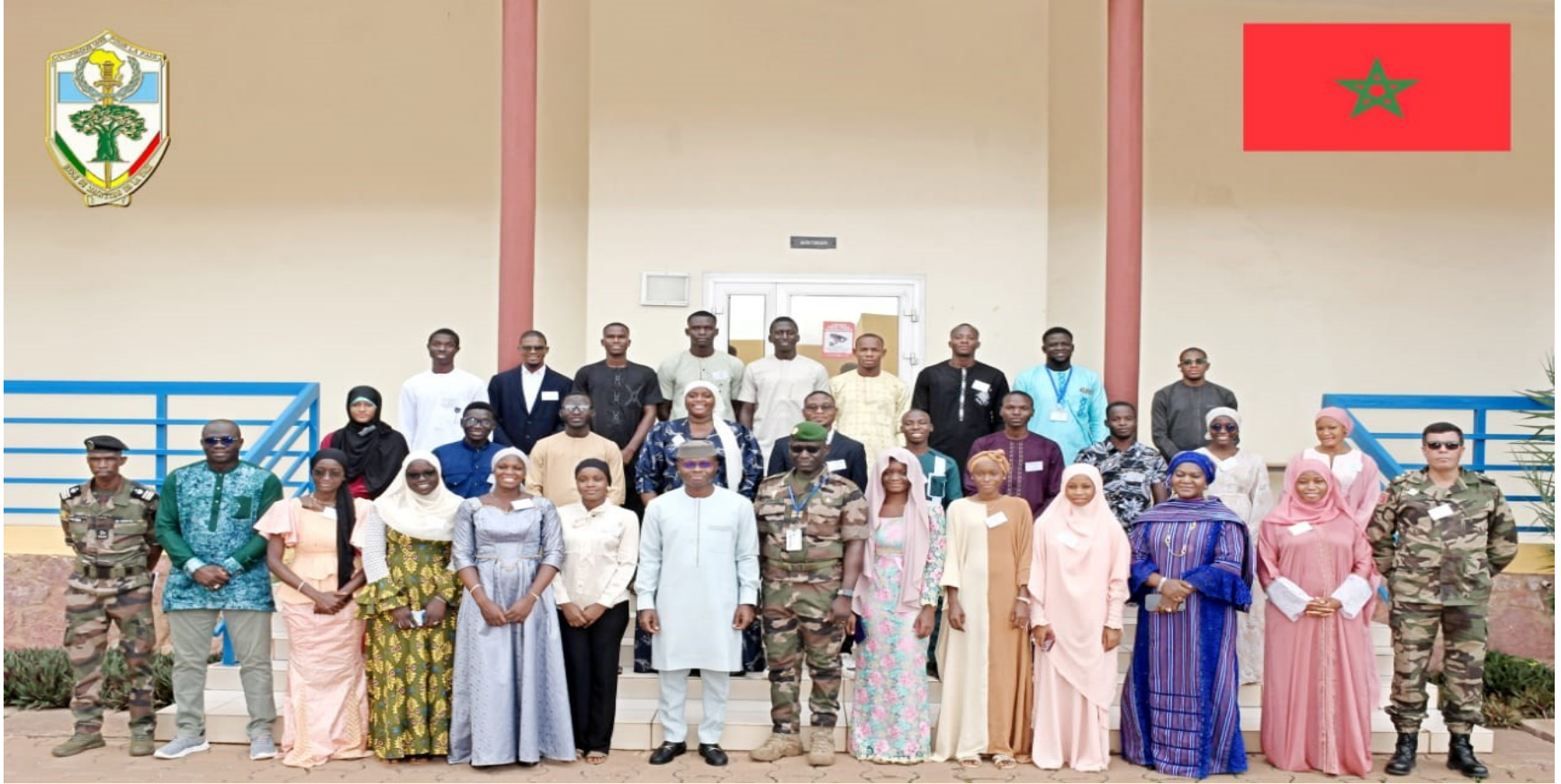
Human rights (DH 2-25 MAROC) EMP-ABB (Bamako, Mali) From 21 to 25 July 2025