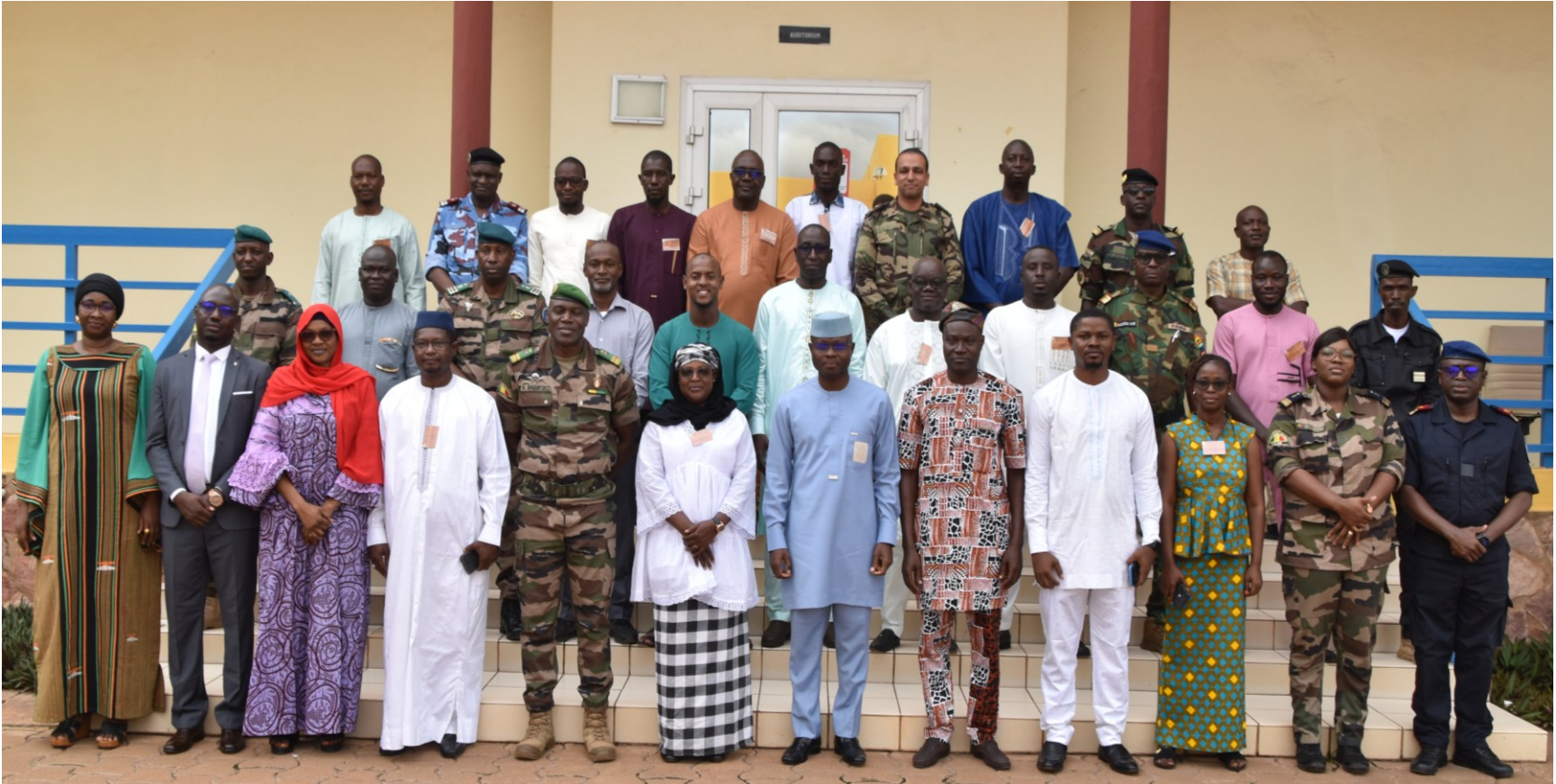
Risk and Disaster Management (GRC 2-25 DEU) EMP-ABB (Bamako, Mali) From 07 to 18 July 2025