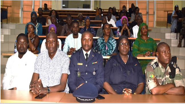
GPS 2-25 (DEU)