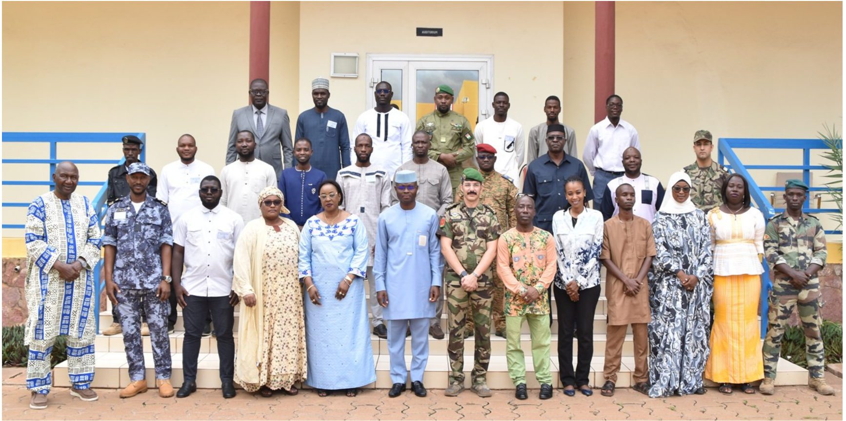
Peacebuilding (Conspaix 2-25 MALI) EMP-ABB (Bamako, Mali) From 07 to 18 July 2025