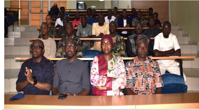
GRC 2-25 (DEU)

To provide participants with the knowledge they need to better understand gender and build their capacity to integrate gender into a peace and security process.