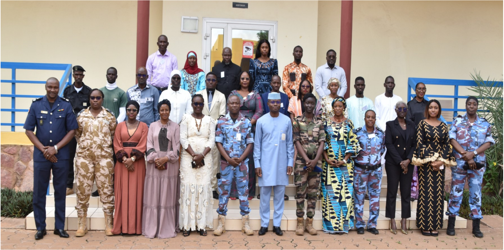
Gender Peace and Security (GPS 2-25 DEU) EMP-ABB (Bamako, Mali) From 07 to 18 July 2025