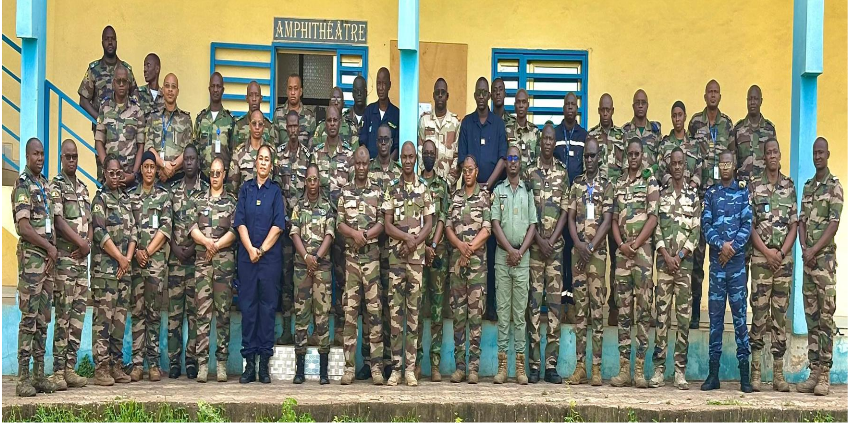
Battalion Command Post (PC BAT 2-25 MALI) Faladiè Gendarmerie School (Bamako, Mali) From 02 to 13 June 2025