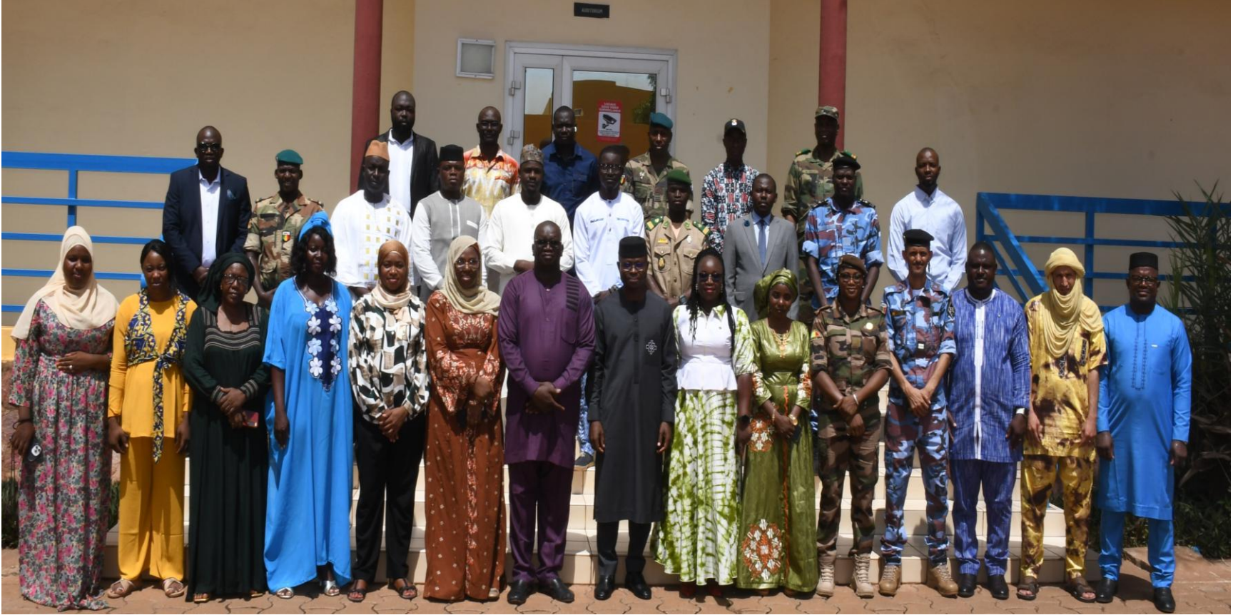
Human Factors in the Fight against Terrorism and Violent Extremism (FHLCTEV 1-25 DEU) EMP-ABB From 16 to 27 June 2025