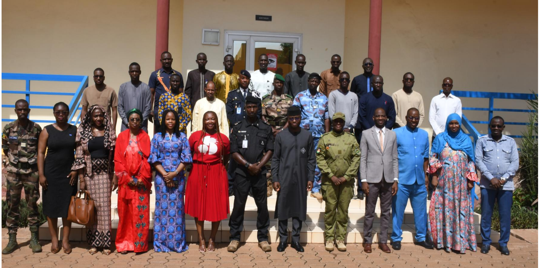
Transitional Justice (JT 1-25 DEU) EMP-ABB From 16 to 27 June 2025