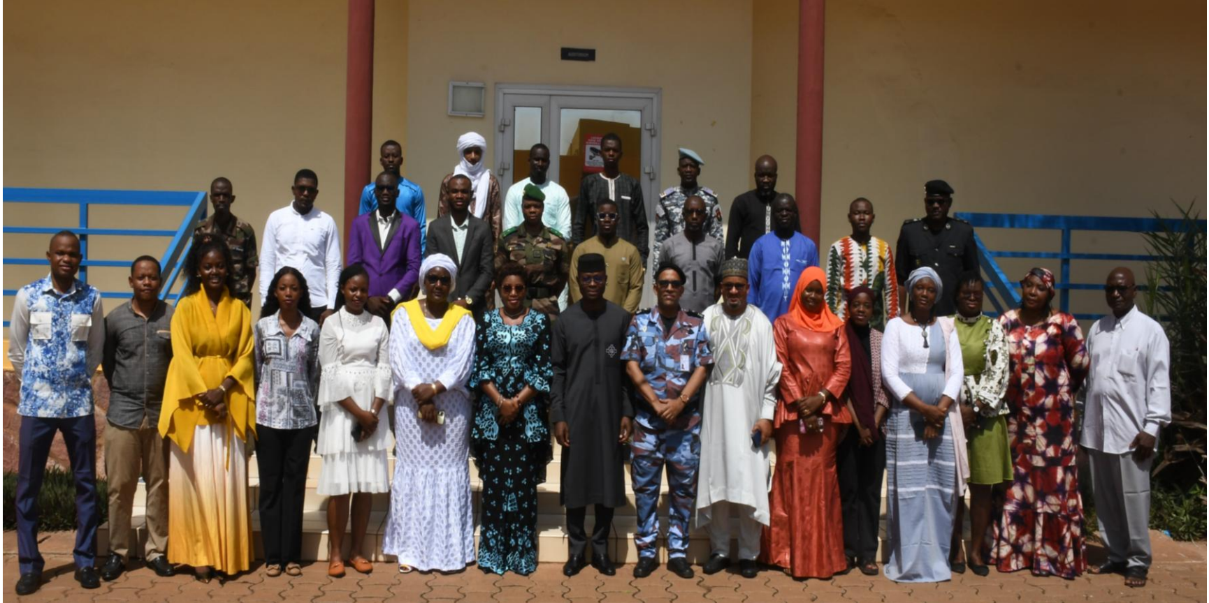
Human Rights (DH 1-25 DEU) EMP-ABB From 16 to 27 June 2025