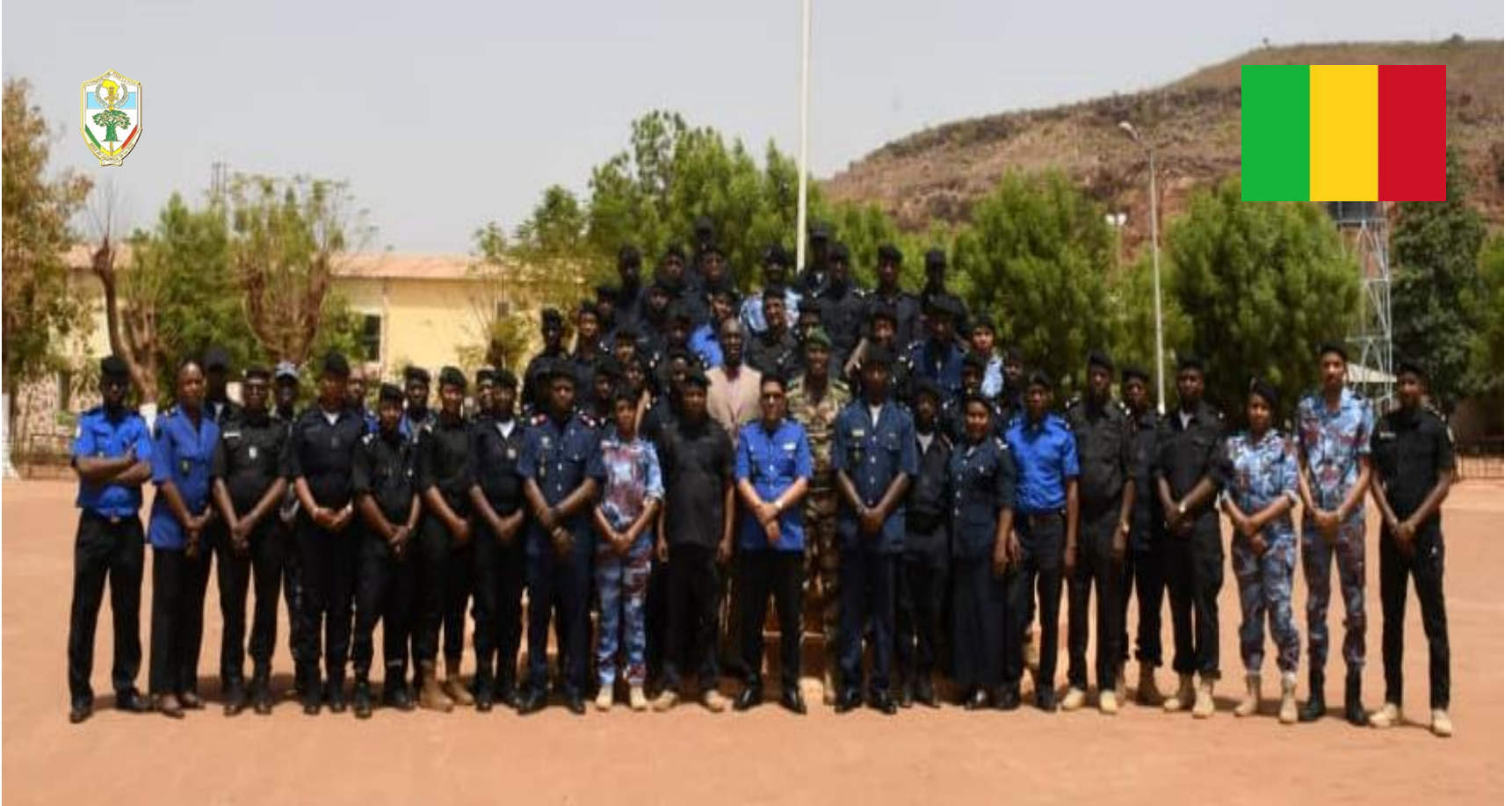
United Nations Police – UNPOL 3-24 National Police School, Bamako Du 15 au 26 avril 2024