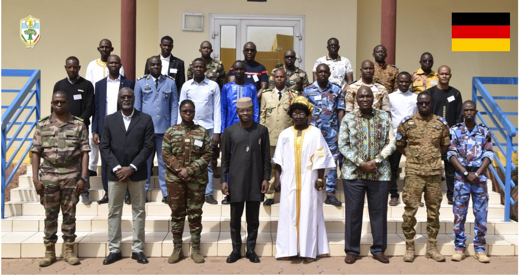
Contingent-owned equipment - MAC/COE EMP-ABB