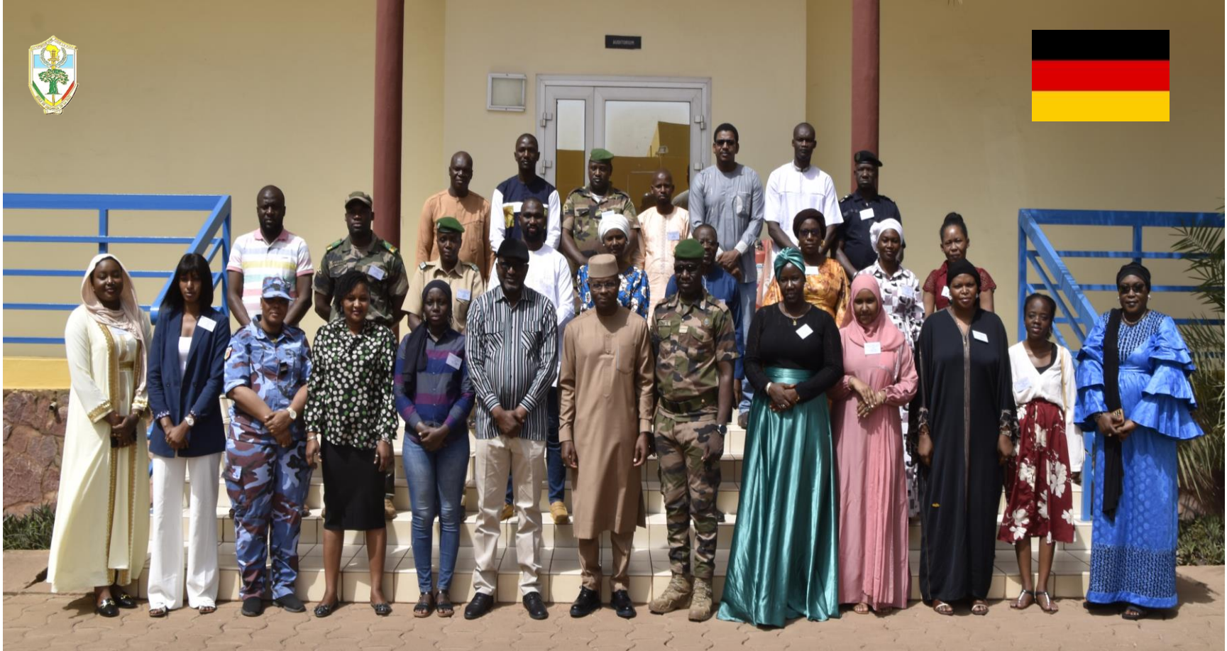
Fundamental Knowledge of Peace Operations - CONFOND 1-24 EMP-ABB