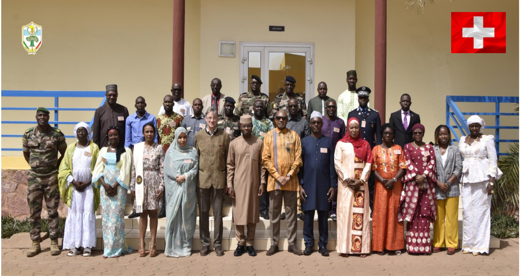
Political and Community Mediation – MPC 2-24 EMP-ABB Du 15 au 26 avril 2024