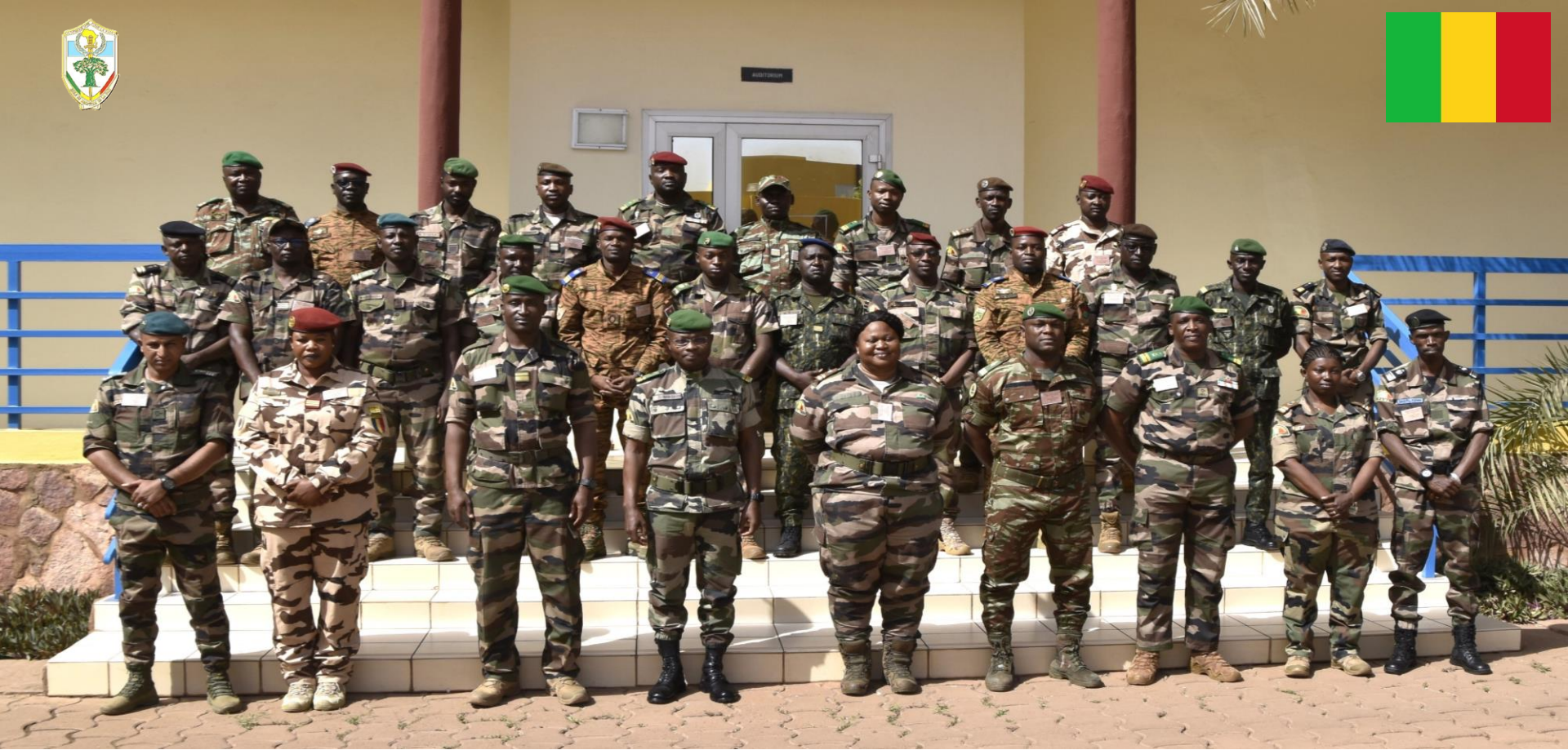
Battalion Command Post – PC BAT EMP-ABB 11 – 22 March 2024