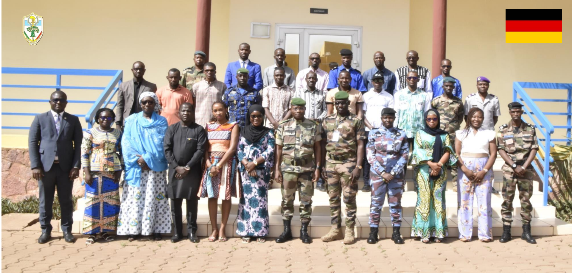
Human rights - DH EMP-ABB 11 – 22 March 2024