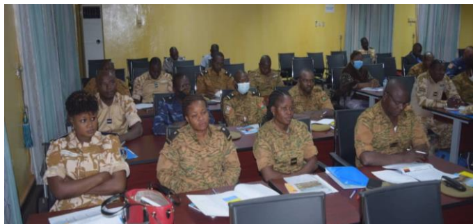
GRC BURKINA FASO