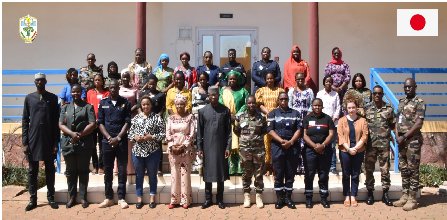
United Nations Civil-Military Coordination - CIMIC EMP-ABB