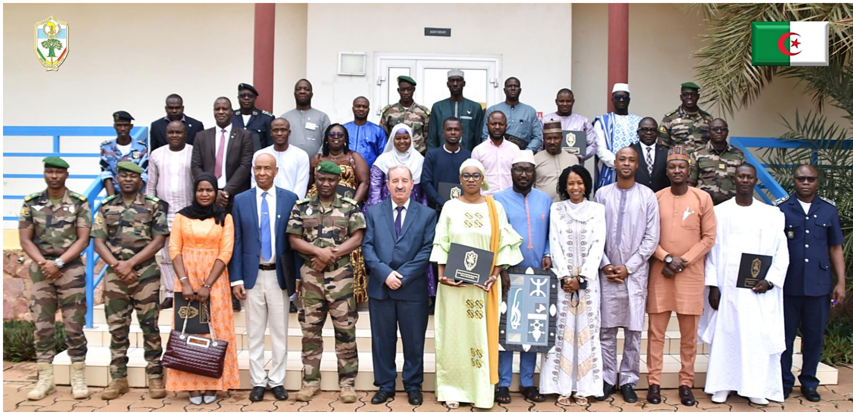
Countering the Financing of Terrorism - CFT EMP-ABB July 17 - 28, 2023