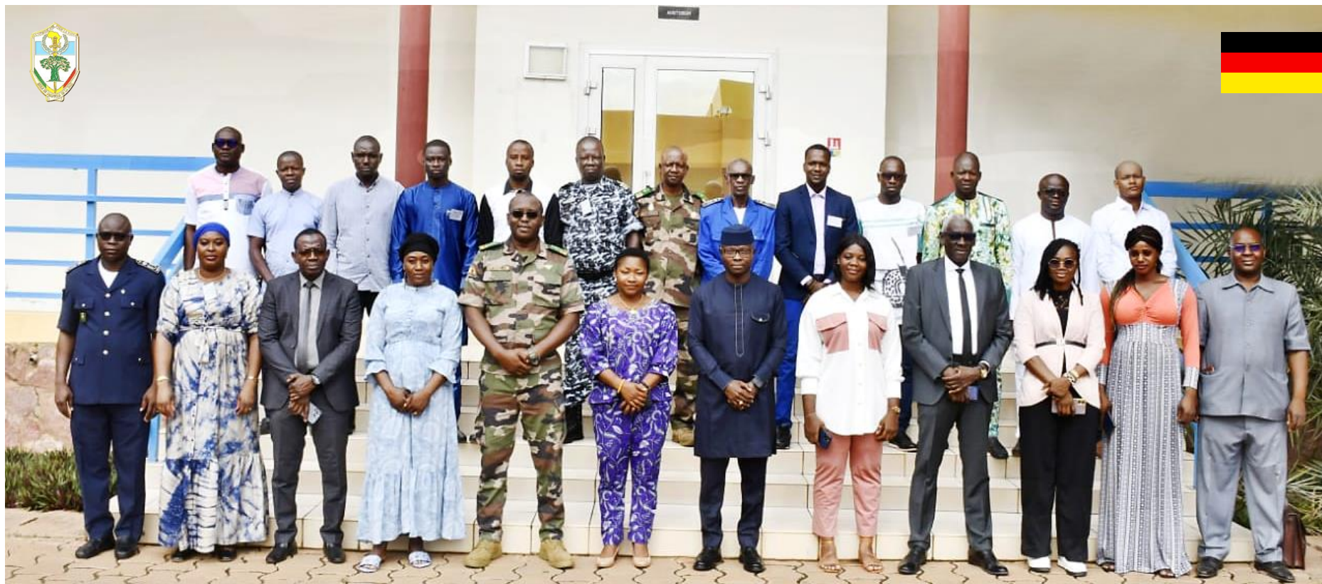
Transitional Justice - TJ EMP-ABB