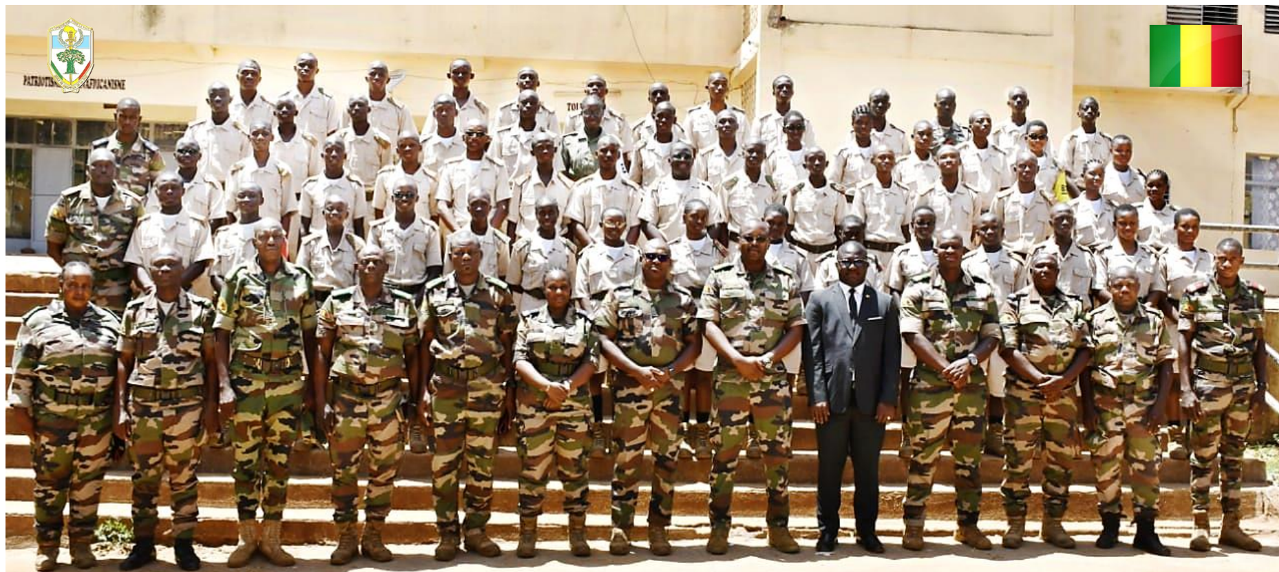
International Humanitarian Law - IHL KATI Military Prytanée of Kati (Kati, MALI) May 3rd - 5th, 2023