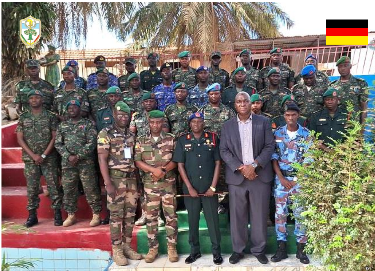
Fundamental Knowledge - CONNFOND GAMBIA Officers' Mess (Kotu, Gambia)