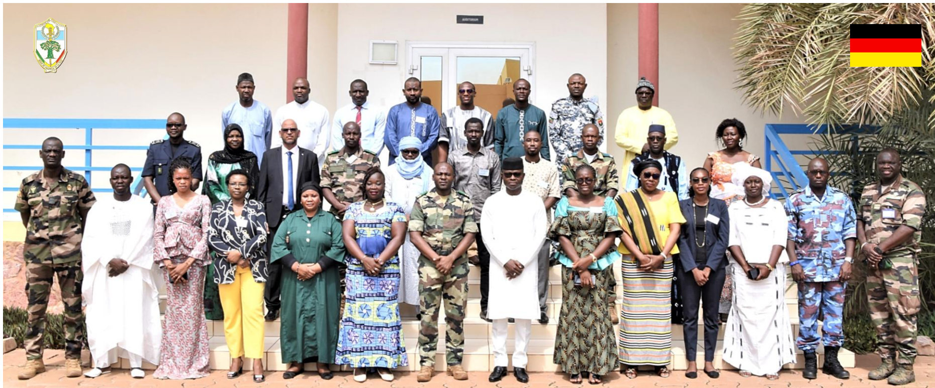
International Humanitarian Law - IHL EMP-ABB June 12 - 23, 2023