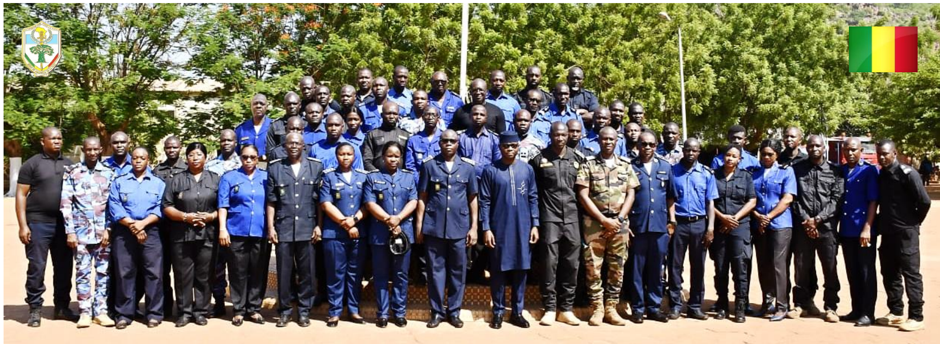
United Nations Police - UNPOL ENP National Police School (Bamako, MALI) May 8th - 19th, 2023