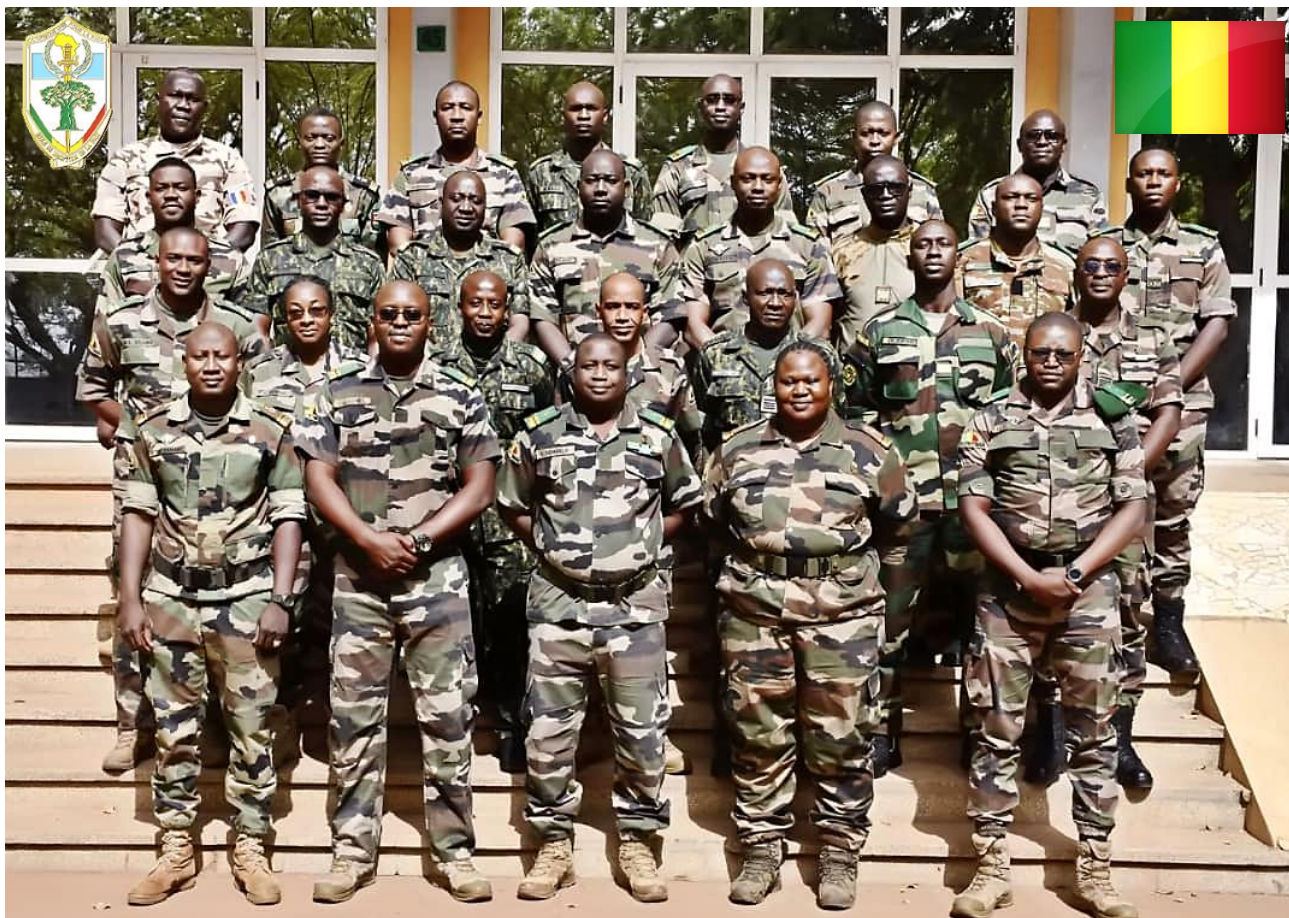
PC-BAT Koulikoro - National Staff College of Koulikoro (EEMNK) Headquarters Battalion 27 mars – 07 avril 2023