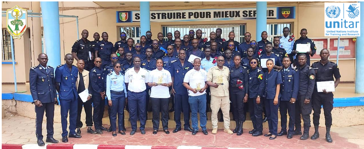
UNPOL SENEGAL United Nations Police February 27 - March 24, 2023