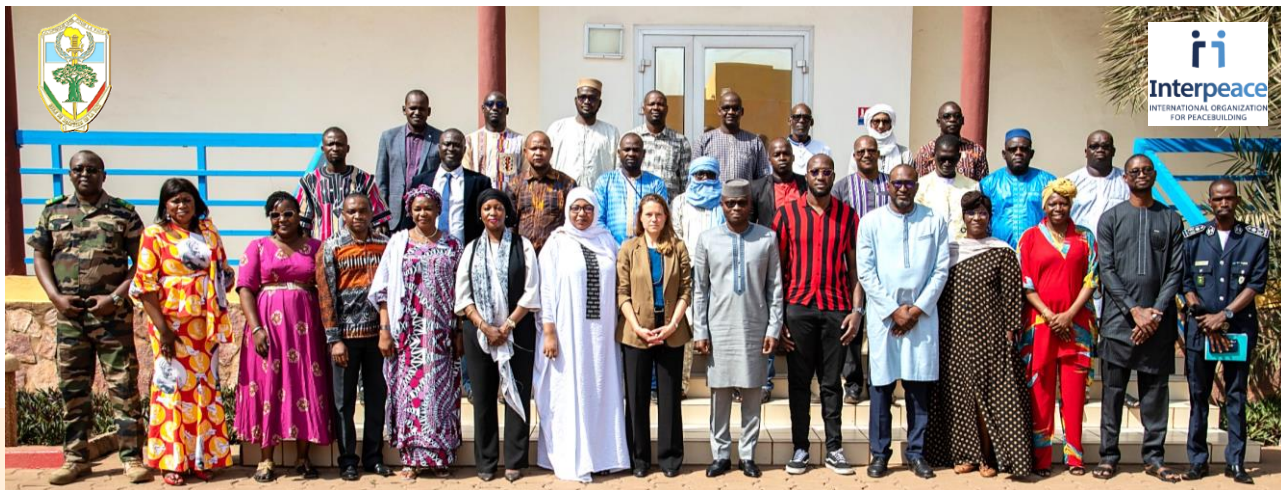
CONFLICT SENSITIVITY AWARENESS March 13 - 24, 2023