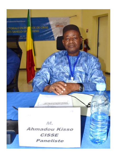
Session 02 - Organizing elections in times of crisis