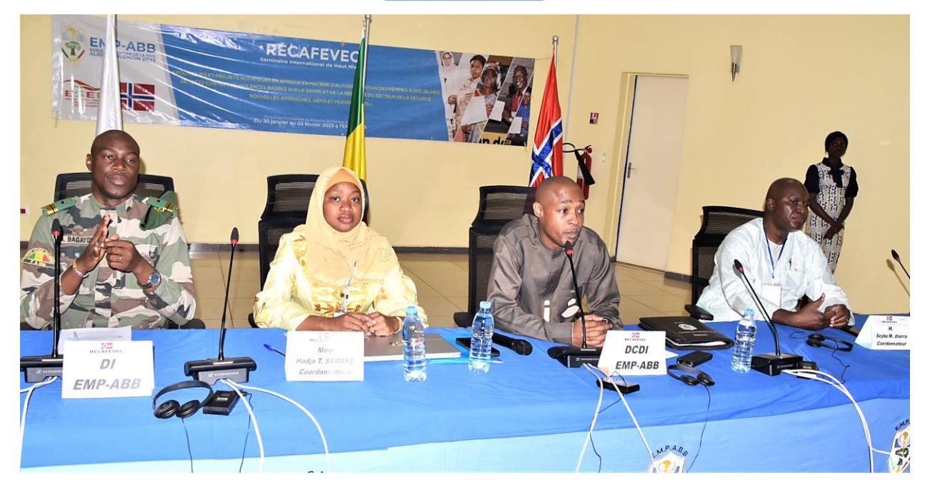
Session 01 - Framework, Objectives and Expected Outcomes of the Seminar