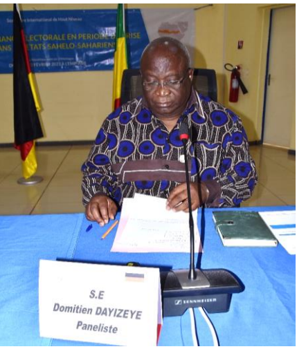
Session 01 - Political and Electoral Governance in Times of Crisis