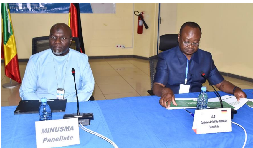
Session 04 - Resource Mobilization for Elections in Times of Crisis