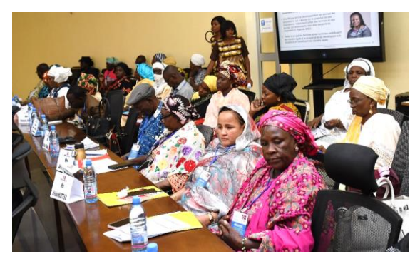
Session 09 - Conclusion and recommendations of the seminar

Validation of proposals and recommendations