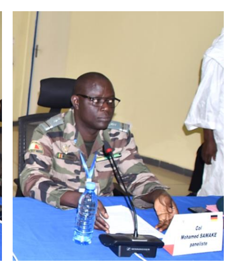
Session 03 - Monitoring and control of electoral operations in times of crisis