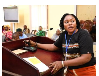
Session 8 - Working and exchange groups (reflections and discussions)

Testimonies and sharing of experiences of participants (Women of the CFS, elected officials, CSOs, etc.) Restitutions in plenary and interactions