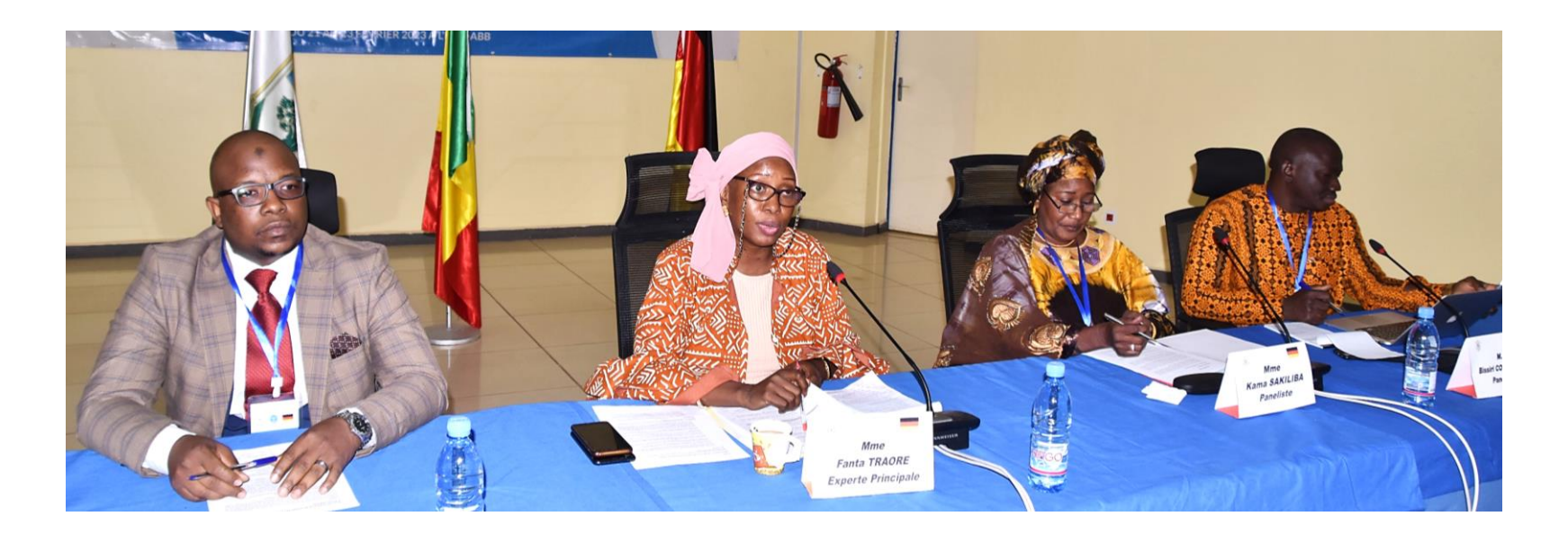
Session 07 - Gender and Elections in Times of Crisis