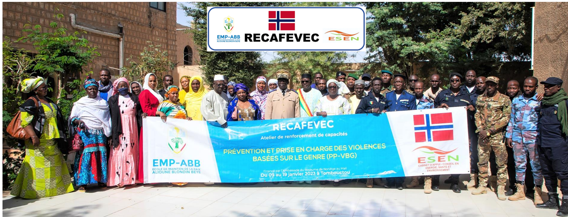
Prevention and Management of Gender-Based Violence PM-GBV - Tombouctou January 09 – 19, 2022