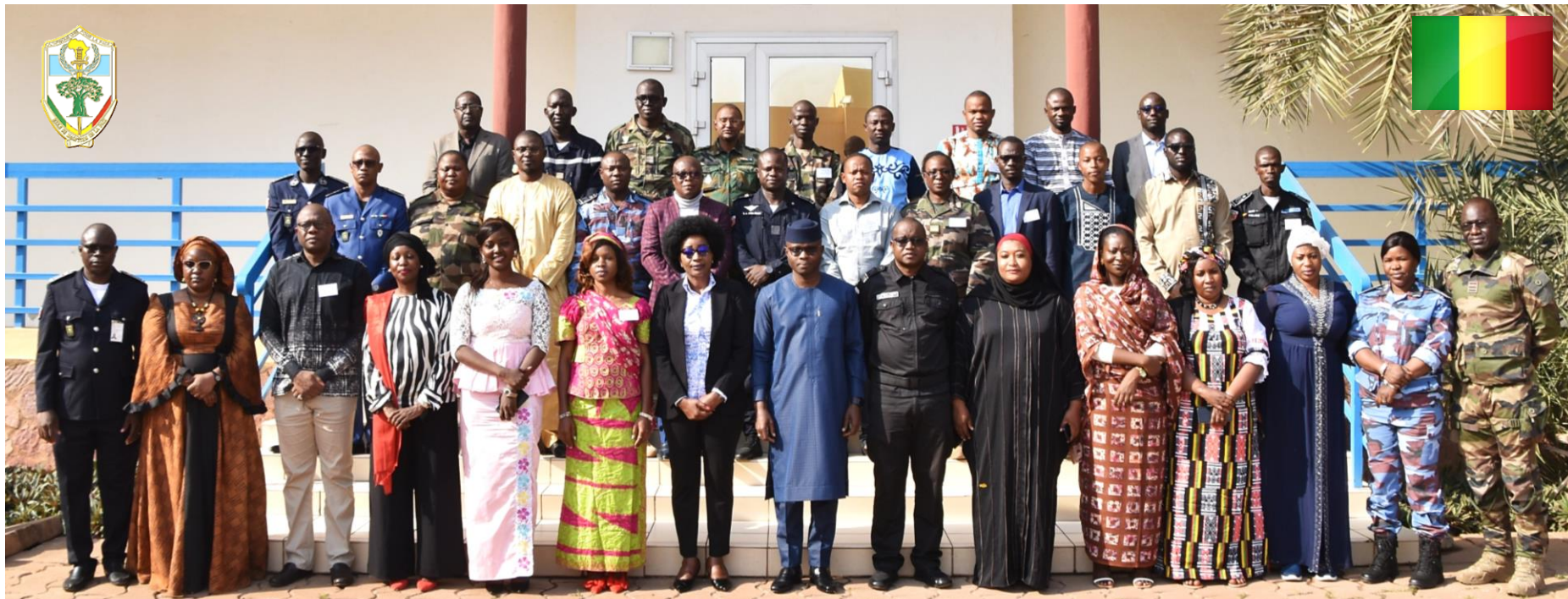
Training of Trainers – ToT January 16 – 27, 2023