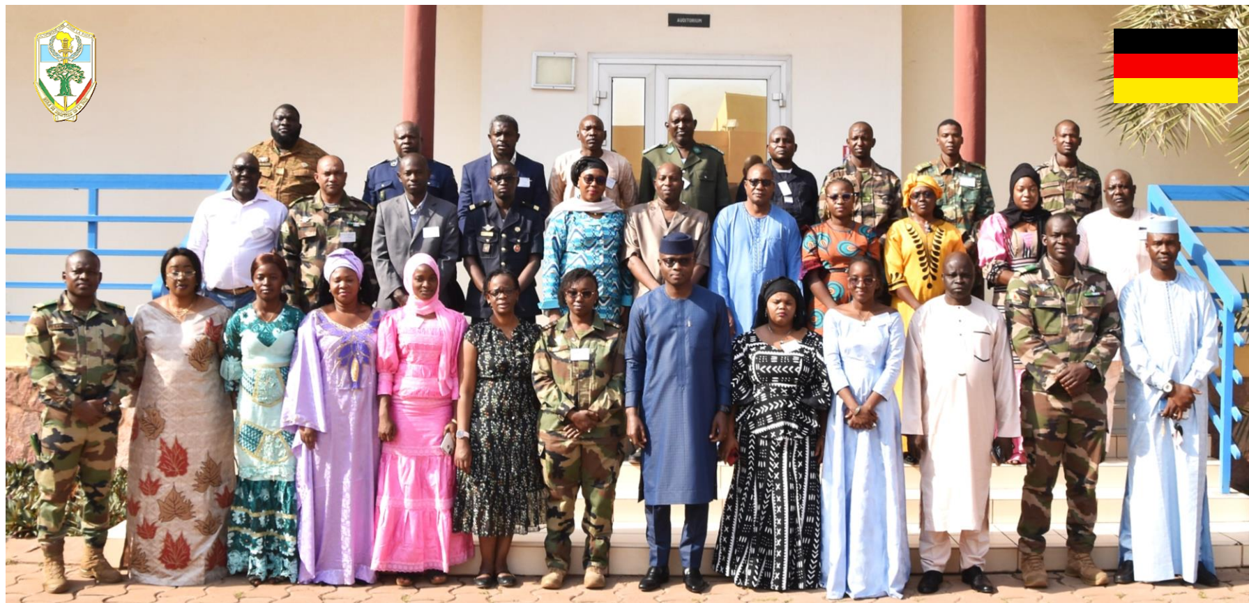
Stabilisation January 16 – 27, 2023