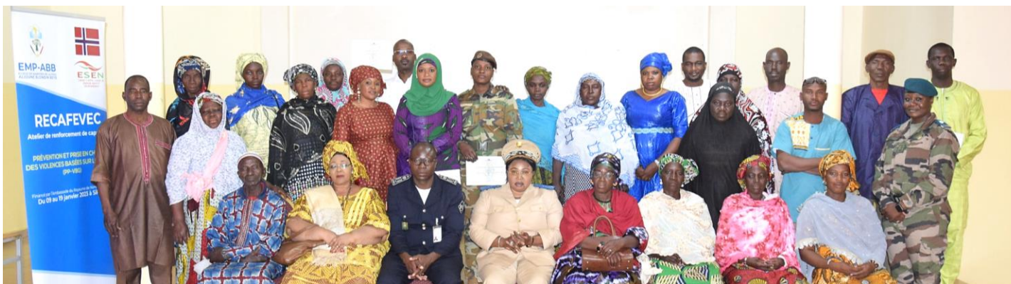
Prevention and Management of Gender-Based Violence - PM-GBV - Sikasso January 09 – 19, 2022