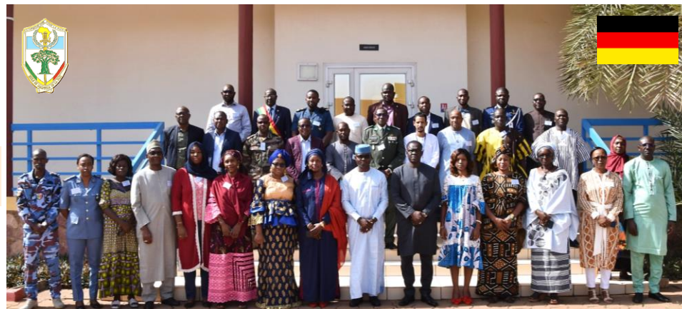
Electoral Process Support - APE December 05 – 16, 2022