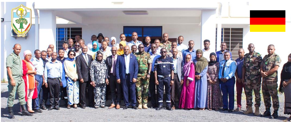
Disaster Risk Management - GRC Comores November 28 – December 09