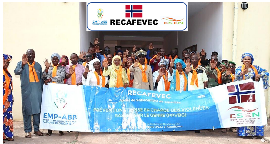
Prevention and Management of Gender-Based Violence – PP-VBG PM-GBV - Koulikoro December 05 – 16, 2022