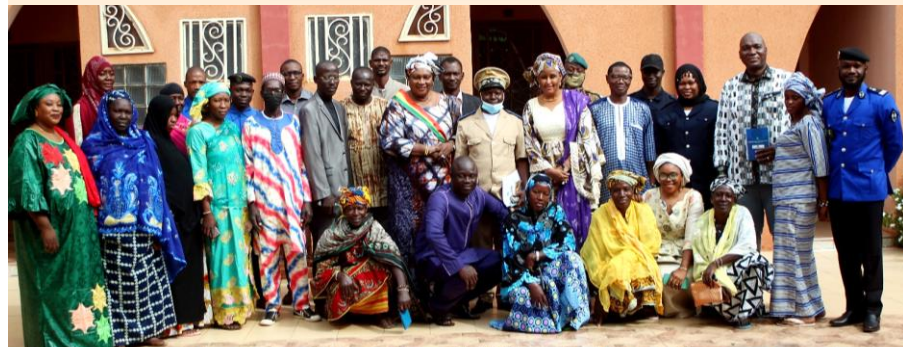
Prevention and Management of Gender-Based Violence PP-GBV - Mopti November 21 – 25, 2022