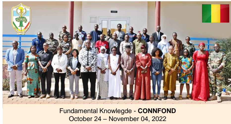
Fundamental Knowledge - CONNFOND October 24 – November 04, 2022