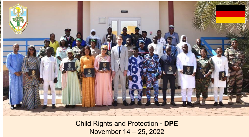
Child Rights and Protection - DPE November 14 – 25, 2022