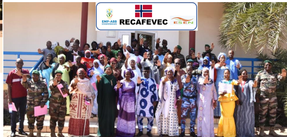
Prevention and Management of Gender-Based Violence PP-GBV - Bamako November 18 – 25, 2022