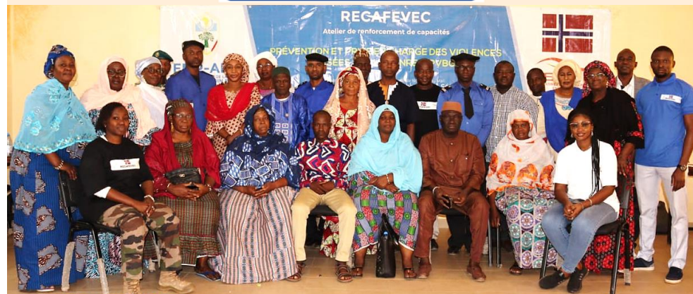
Prevention and Management of Gender-Based Violence PP-GBV - Ségou November 21 – 25, 2022