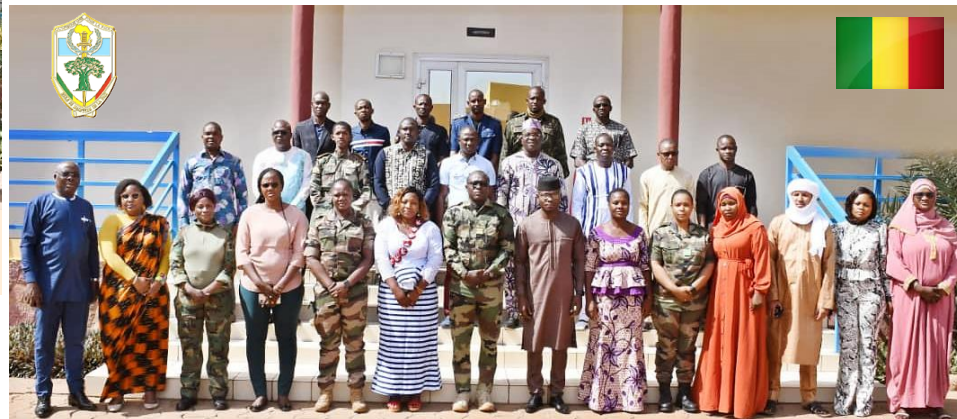
Protection of Civilians - PoC October 24 – November 04, 2022