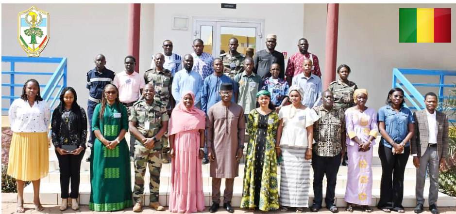
Child Rights and Protection - DPE October 24 – November 04, 2022