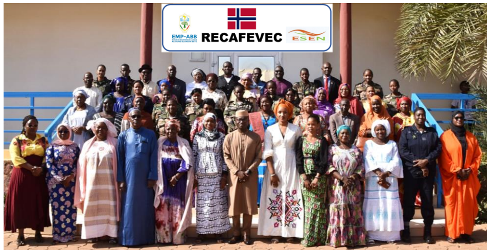
Prevention and Management of Gender-Based Violence PP-GBV - Bamako November 14 – 18, 2022