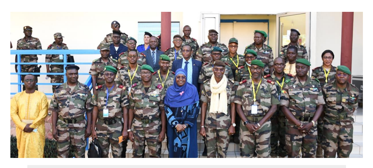
7th Congress of the SoMaMeM at the EMP-ABB