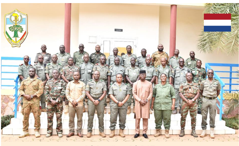
PC Batallion - PC-BAT Sept. 26 – October 07, 2022