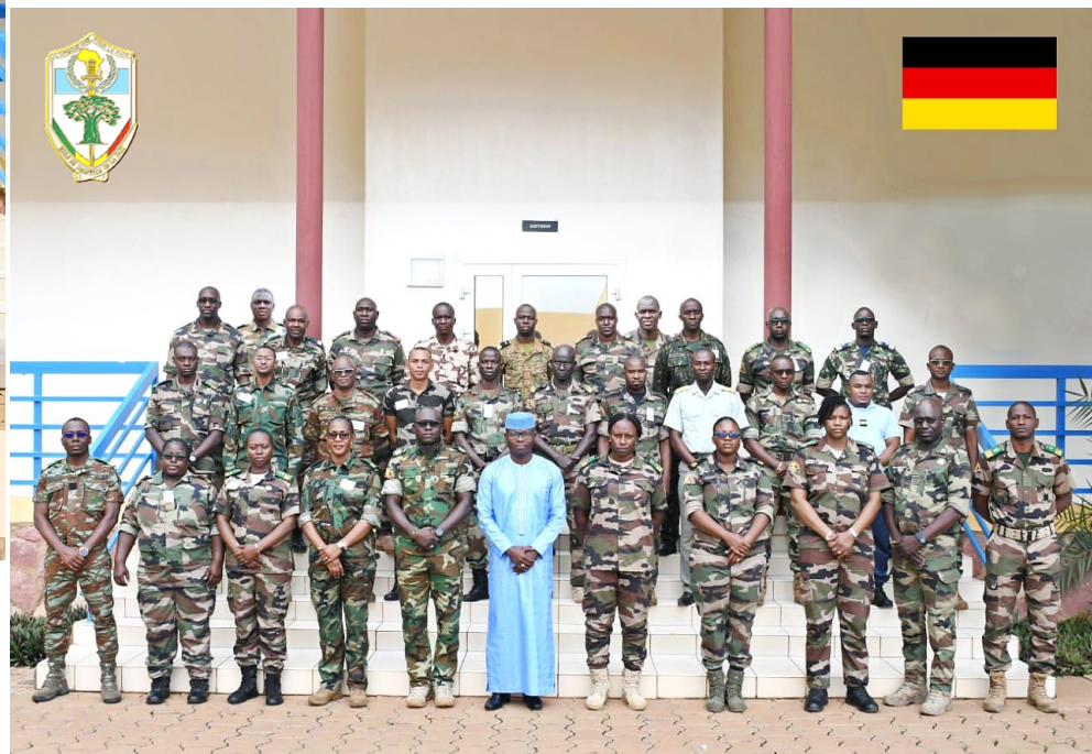
United Nations Military Observers – UNMOs August 29 - September 23, 2022