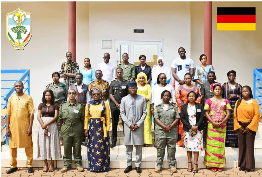
Gender, Peace and Security – GPS September 12 to 23, 2022