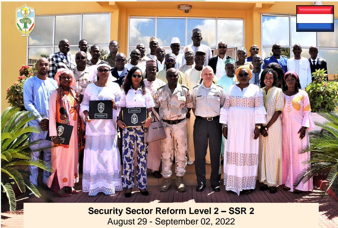
Security Sector Reform Level 2 – SSR 2 August 29 - September 02, 2022