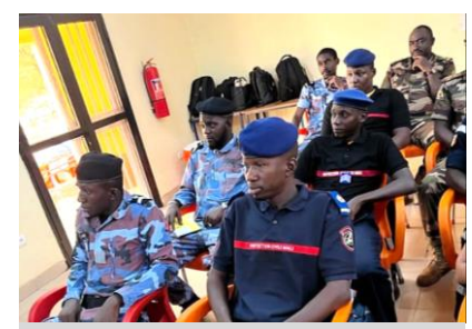
Capacity building in law enforcement and policing techniques

Acquisition of mastery of police techniques and tactics for effective management of public order disturbances and to protect civilian populations against all forms of violence while respecting human rights and integrating the gender dimension.