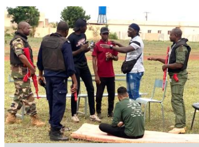
Capacity building in law enforcement and policing techniques

Acquisition of knowledge and know-how essential to Battalion Staff Officers engaged in a UN or African Union peace support operation