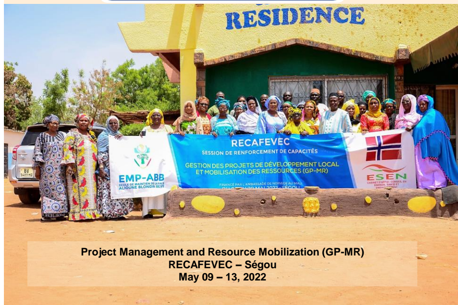
Project Management and Resource Mobilization (GP-MR) RECAFEVEC – Ségou May 09 – 13, 2022