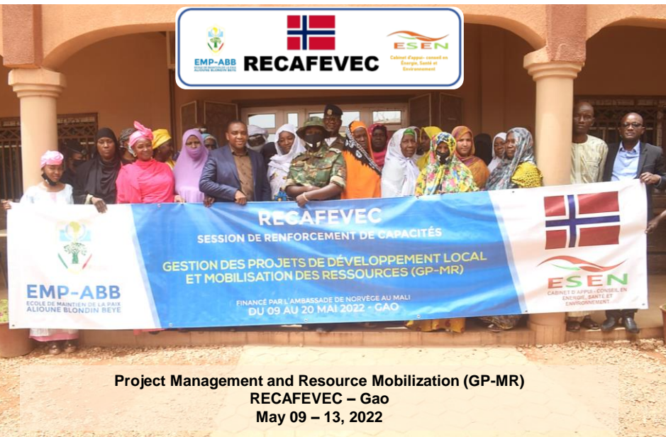
Project Management and Resource Mobilization (GP-MR) RECAFEVEC – Gao May 09 – 13, 2022