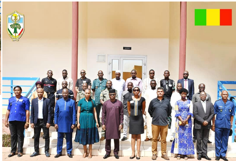
Security Sector Reform (SSR) May 09 – 13, 2022