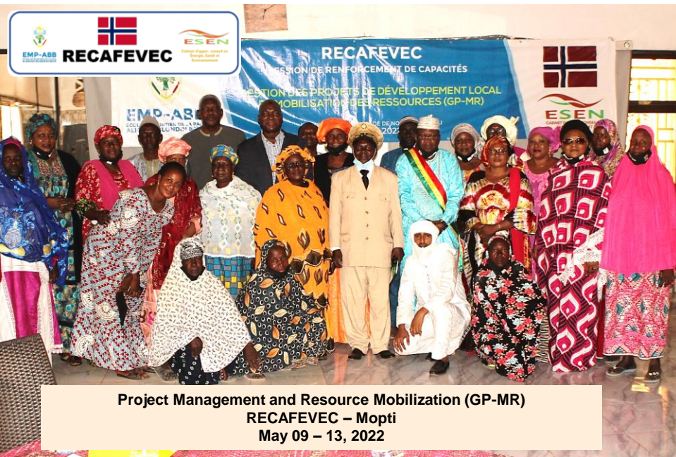
Project Management and Resource Mobilization (GP-MR) RECAFEVEC – Mopti May 09 – 13, 2022