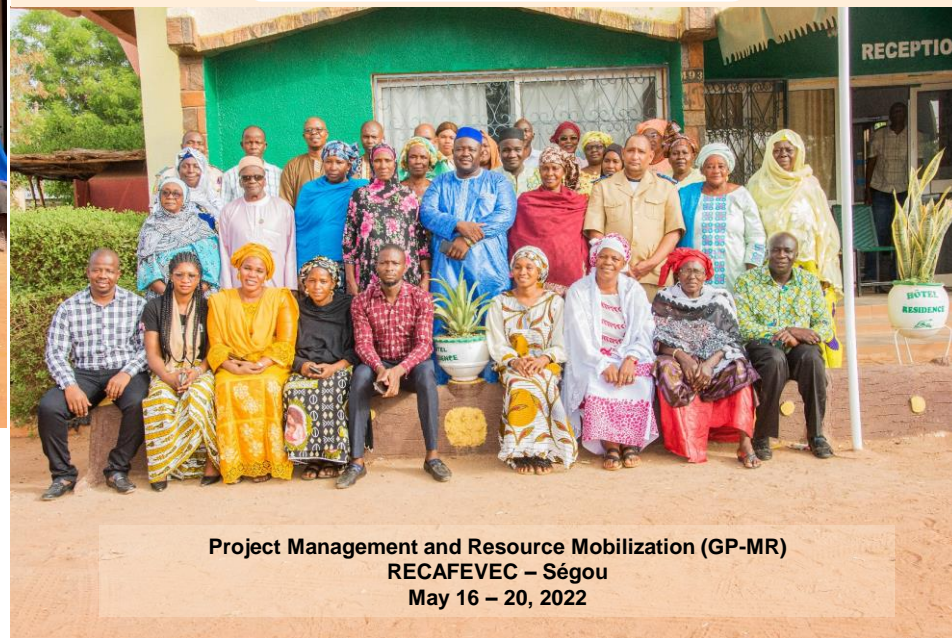
Project Management and Resource Mobilization (GP-MR) RECAFEVEC – Ségou May 16 – 20, 2022