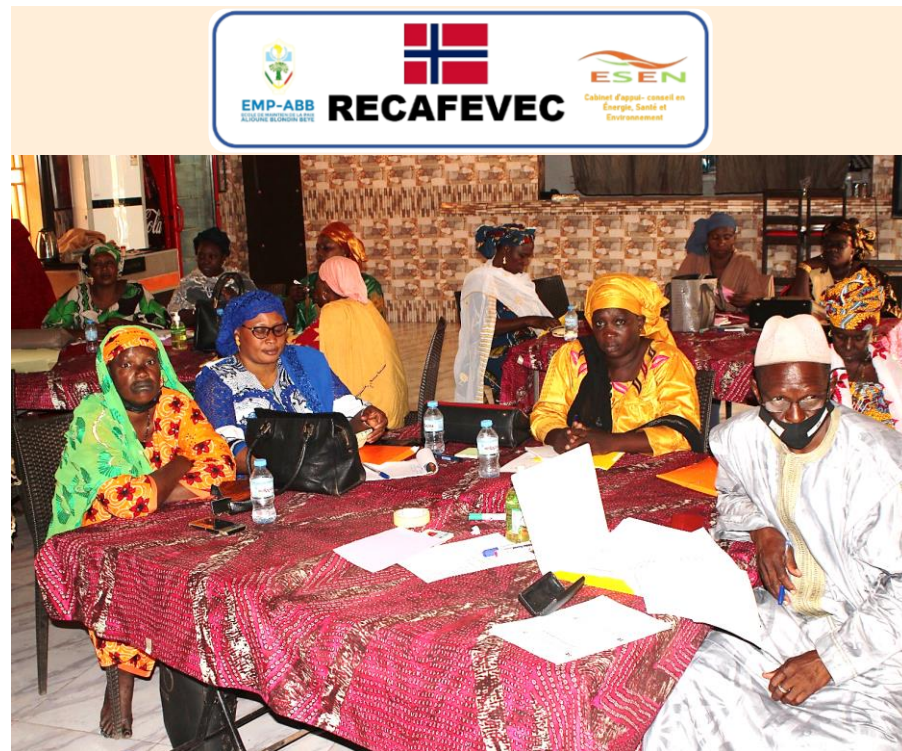
Project Management and Resource Mobilization (GP-MR) RECAFEVEC – Mopti May 16 – 20, 2022