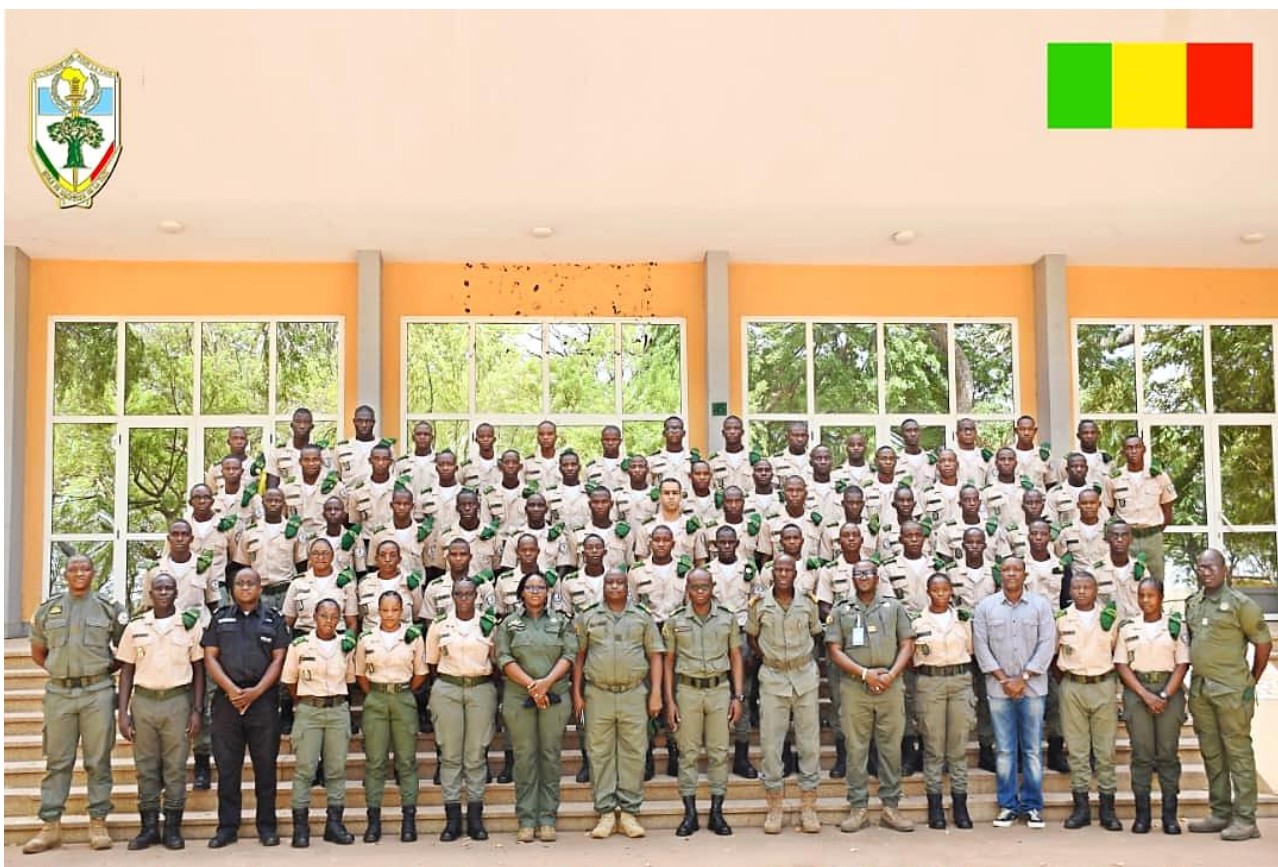
Basic Knowledge (CONNFOND) May 09 – 13, 2022