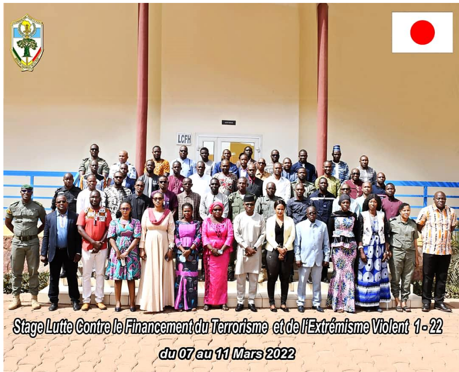
Counteraction against the funding of terrorism March 07 – 11, 2022