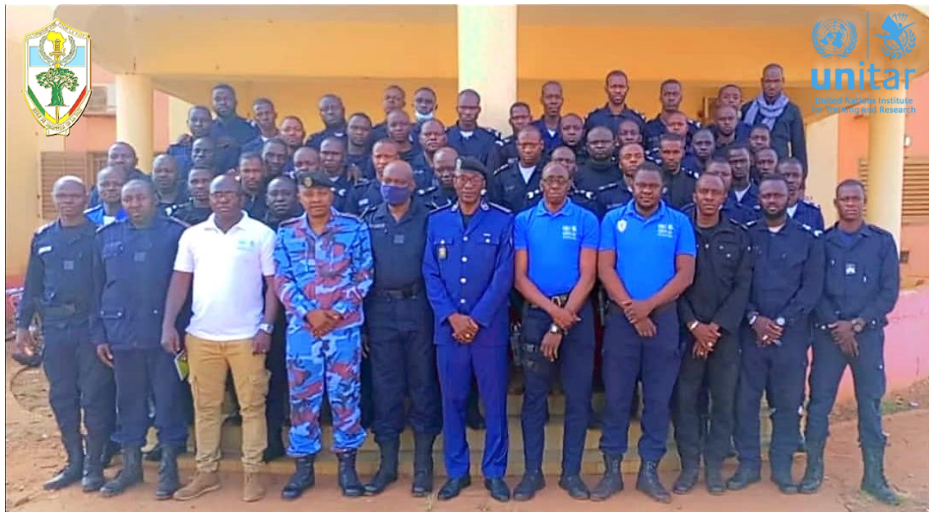
Capacity building in law enforcement and policing techniques February 28 – Mars 24, 2022