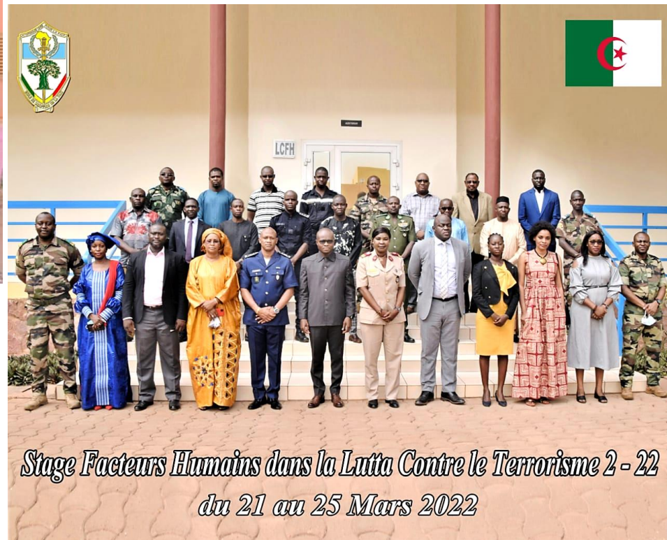
Human Factors in the Fight against Terrorism March 21 – 25, 2022