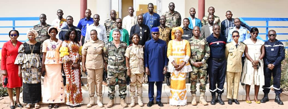
Stage Gestion des Risques de Catastrophe 1 - 22 Japon du 28 Février au 11 Mars 2022

Disaster Risk Management (DRM) February 28 – Mars 04, 2022