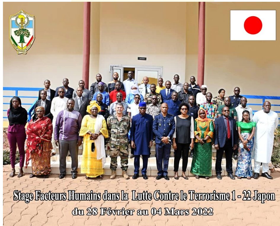
Human Factors in the Fight against Terrorism February 28 – Mars 04, 2022