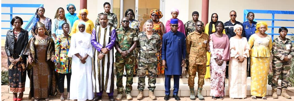
Stage UN-CIMIC 1 - 22 Japon du 28 Février au 11 mars 2022

Civil-Military Coordination of the United Nations (UN-CMIC) February 28 – Mars 11, 2022