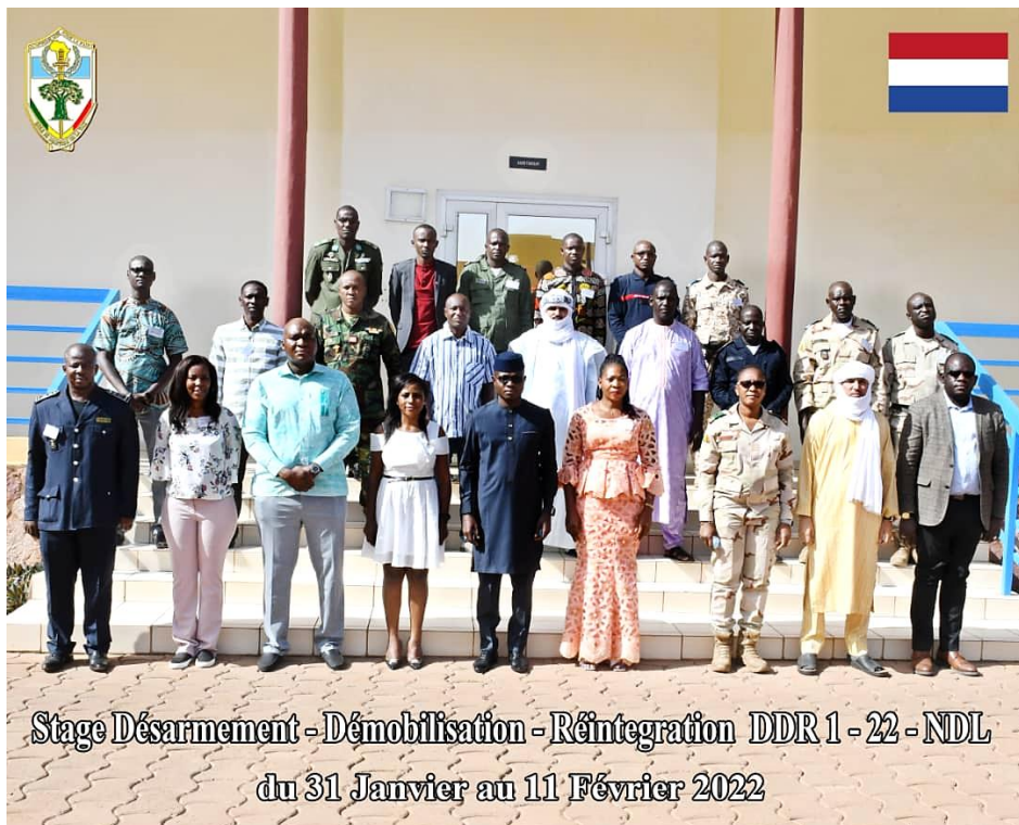
Stage Désarmement - Démobilisation - Réintégration DDR 1 - 22 - NDL du 31 Janvier au 11 Février 2022

Disarmament, Demobilization and Reintegration (DDR)