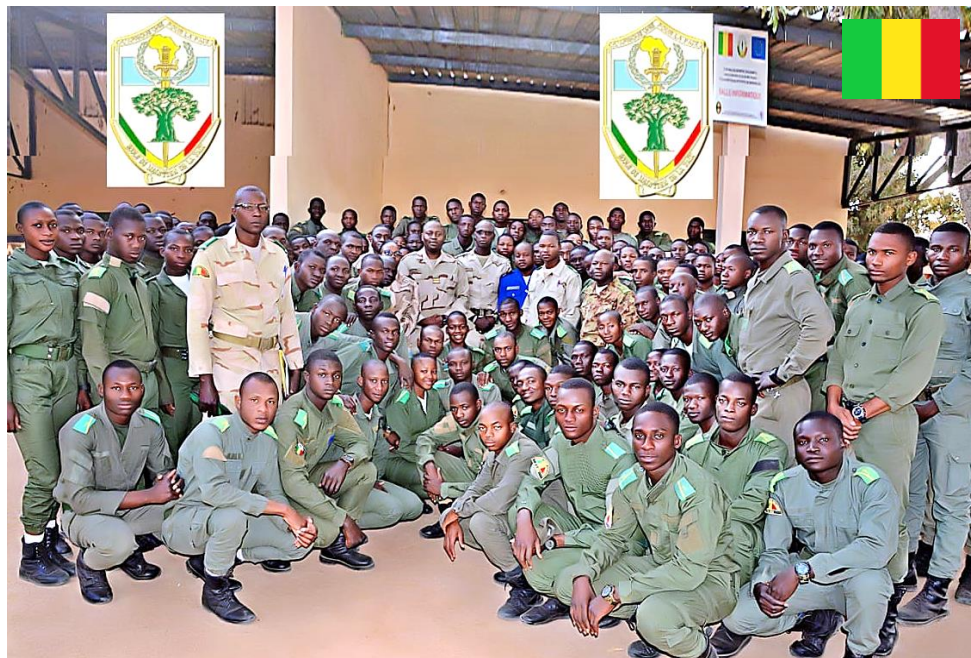
Conférence sur les Operations de Soutien à la Paix, au profit de la 2 e Année de l'ESO (Banankoro) 25 février 2022