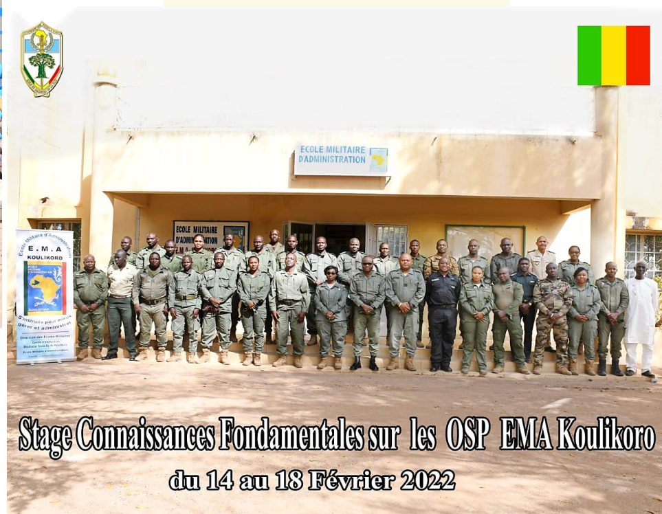
Stage Connaissances Fondamentales sur les OSP EMA Koulikoro du 14 au 18 Février 2022

Fundamental Knowledge in Koulikoro (ConnFond)