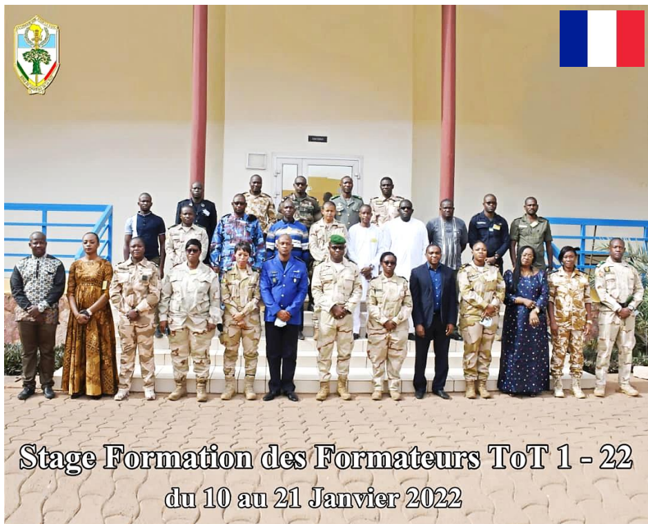
Stage Formation des Formateurs ToT 1 - 22 du 10 au 21 Janvier 2022