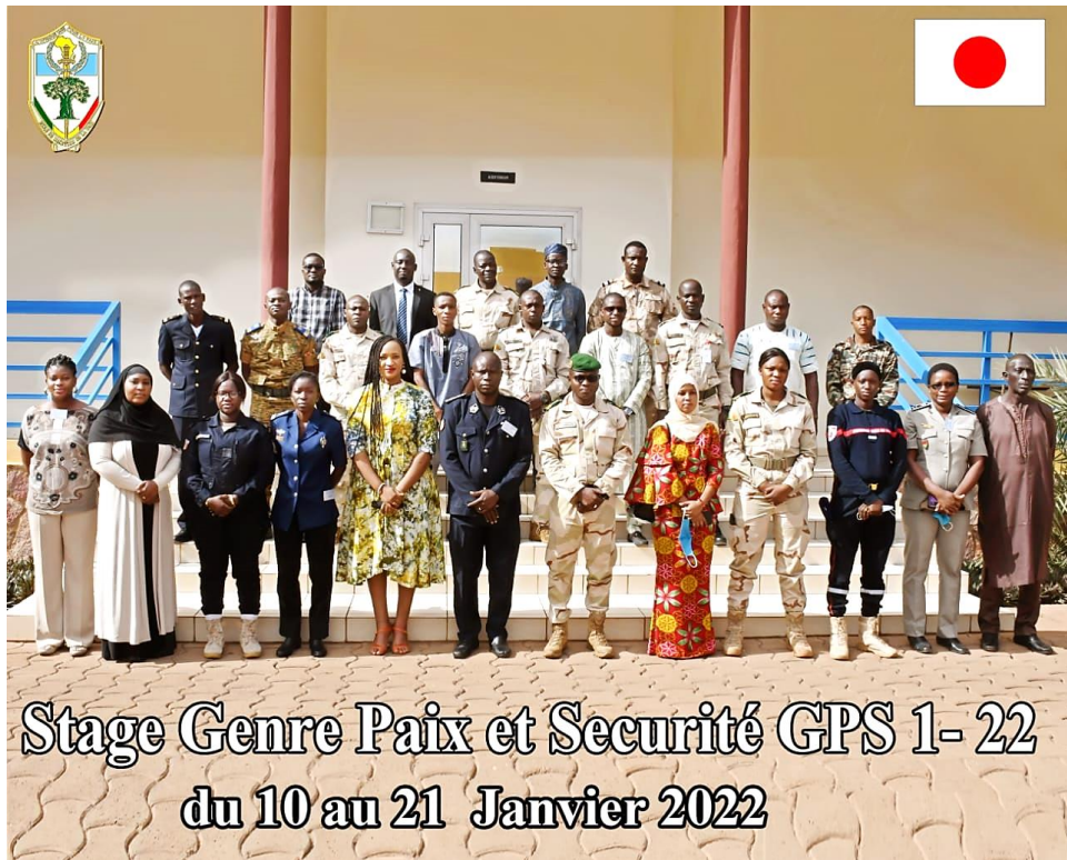
Stage Genre Paix et Sécurité GPS 1- 22 du 10 au 21 Janvier 2022