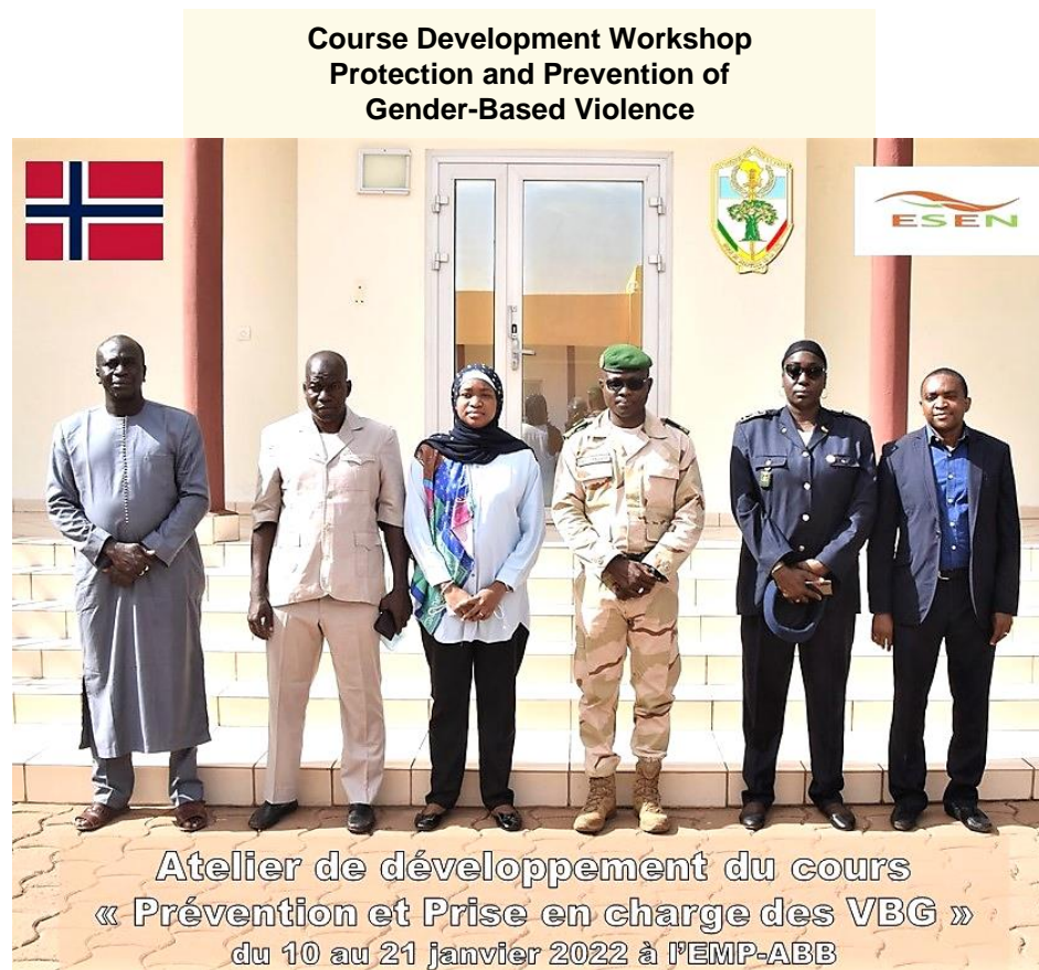
Course Development Workshop Protection and Prevention of Gender-Based Violence

Atelier de développement du cours « Prévention et Prise en charge des VBG » du 10 au 21 janvier 2022 à l'EMP-ABB