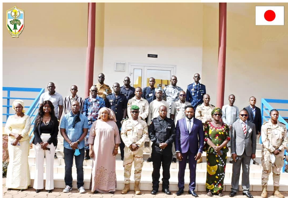
Stage Protection des Civils PoC 1- 22 du 10 au 21 Janvier 2022