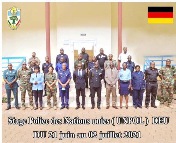
United Nations Police

Stage Consolidation de la Paix DU 21 juin au 02 juillet 2021