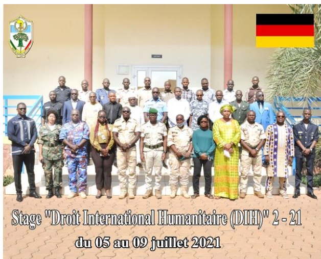
International Humanitarian Law