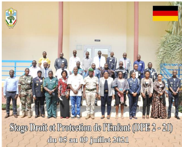
Child Rights and Protection