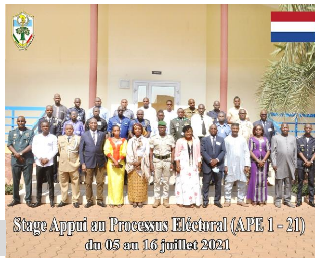
Support to the Electoral Process