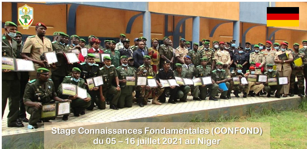
Stage Connaissances Fondamentales (CONFOND) du 05 – 16 juillet 2021 au Niger