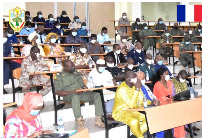
FIGHT AGAINST THE FINANCING OF TERRORISM

Stage Police des Nations unies ( UNPOL ) DEU DU 21 juin au 02 juillet 2021