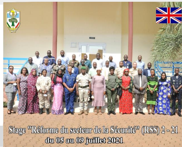
Security Sector reform