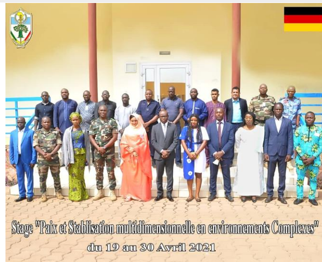
Stage "Paix et Stabilisation multidimensionnelle en environnements Complexes" du 19 au 30 Avril 2021

STABILISATION Peace and Multidimensional Stabilization in Complex Environments