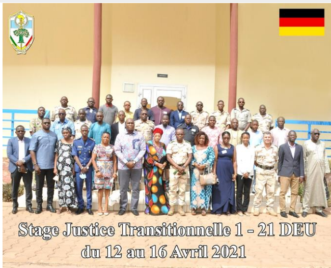
Stage Justice Transitionnelle 1 - 21 DEU du 12 au 16 Avril 2021