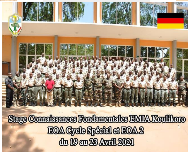
Stage Connaissances Fondamentales EMIA Koulikoro EOA Cycle Spécial et EOA 2 du 19 au 23 Avril 2021

STABILISATION Peace and Multidimensional Stabilization in Complex Environments