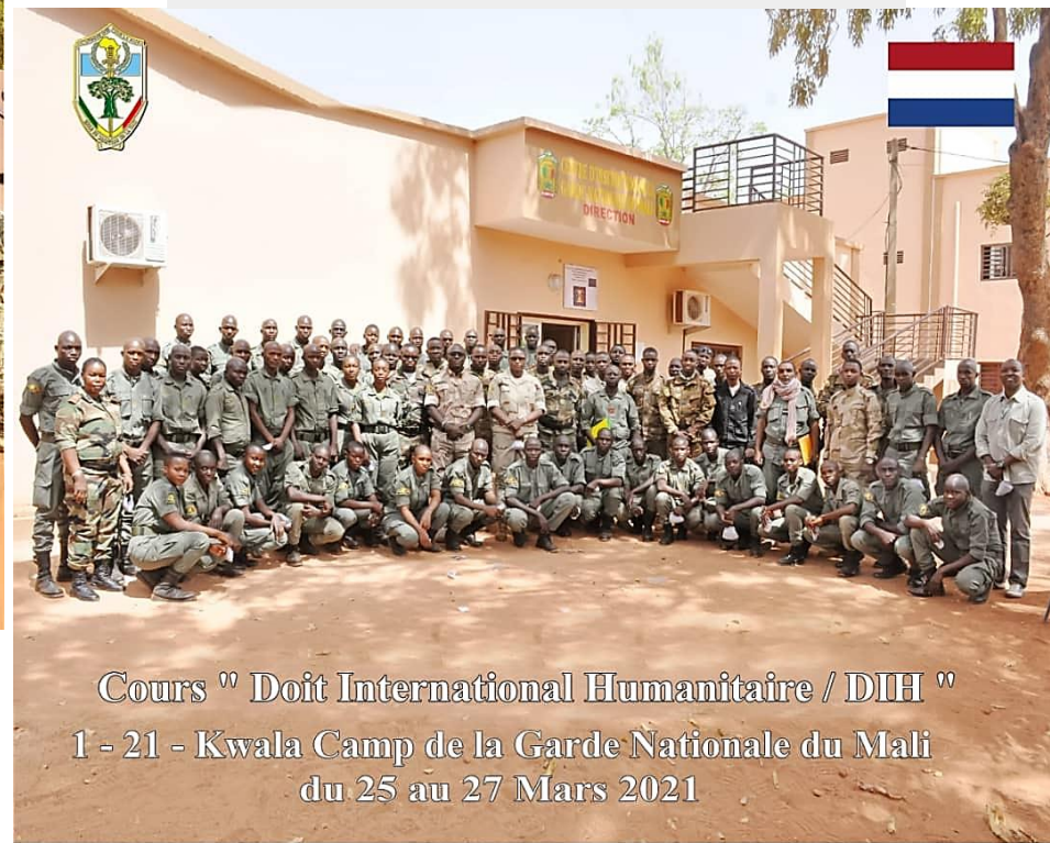
Cours " Droit International Humanitaire / DIH " 1 - 21 - Kwala Camp de la Garde Nationale du Mali du 25 au 27 Mars 2021