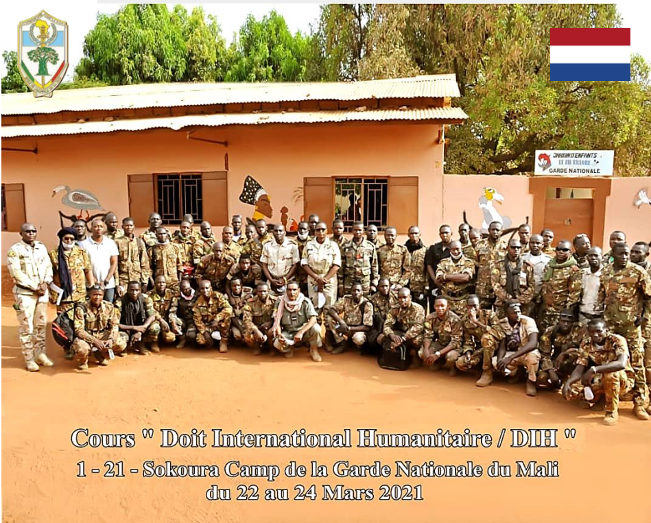
Cours " Droit International Humanitaire / DIH " 1 - 21 - Sokoura Camp de la Garde Nationale du Mali du 22 au 24 Mars 2021