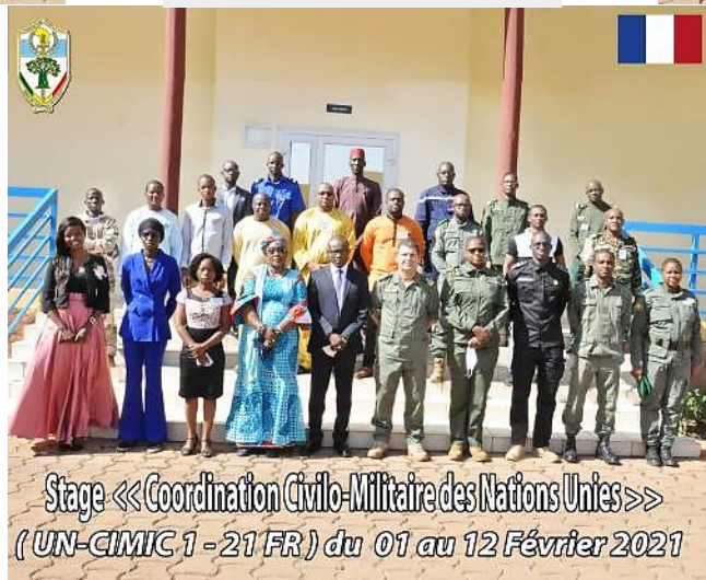
Stage << Coordination Civilo-Militaire des Nations Unies >> ( UN-CIMIC 1 -21 FR ) du 01 au 12 Février 2021