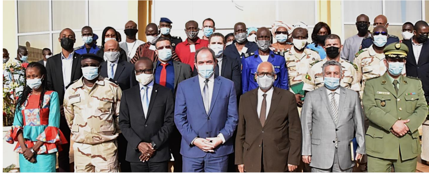
The People's Democratic Republic of Algeria, President of the CSA, joins EMP-ABB's Board of Directors

On Wednesday, February 10 th , 2021 , the People's Democratic Republic of Algeria, President of the Peace Agreement Monitoring Committee (CSA) joined the Board of Directors of the Alioune Blondin Beye Peacekeeping School.