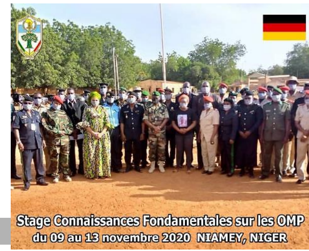
CONNFOND in Niger