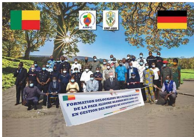
GRC in BENIN