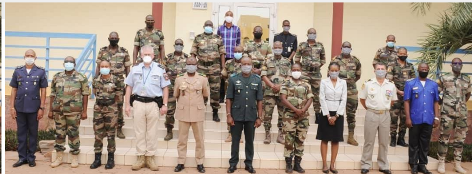
" l'Etat de la Reforme du secteur de Sécurité au Mali dans le cadre de l'APR" DEU du 08 au 12 Juin 2020