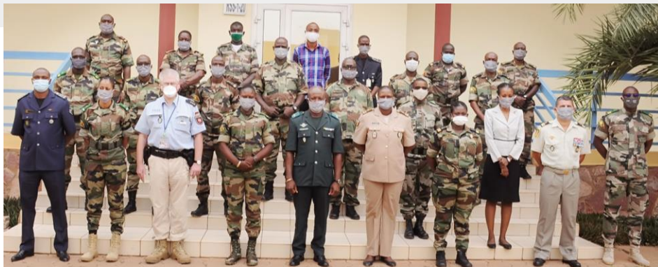
Stage CIMIC - FAMa - 2 - 20 DEU du 08 au 12 Juin 2020