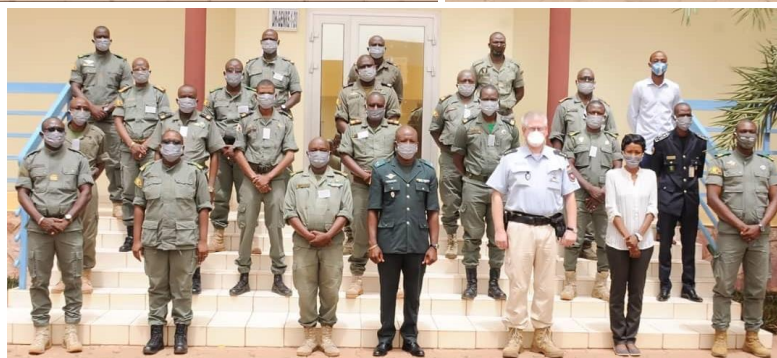
Stage "Renforcement des capacités des Officiers d'Etat - major de PC GTIA" du 15 au 19 juin 2020